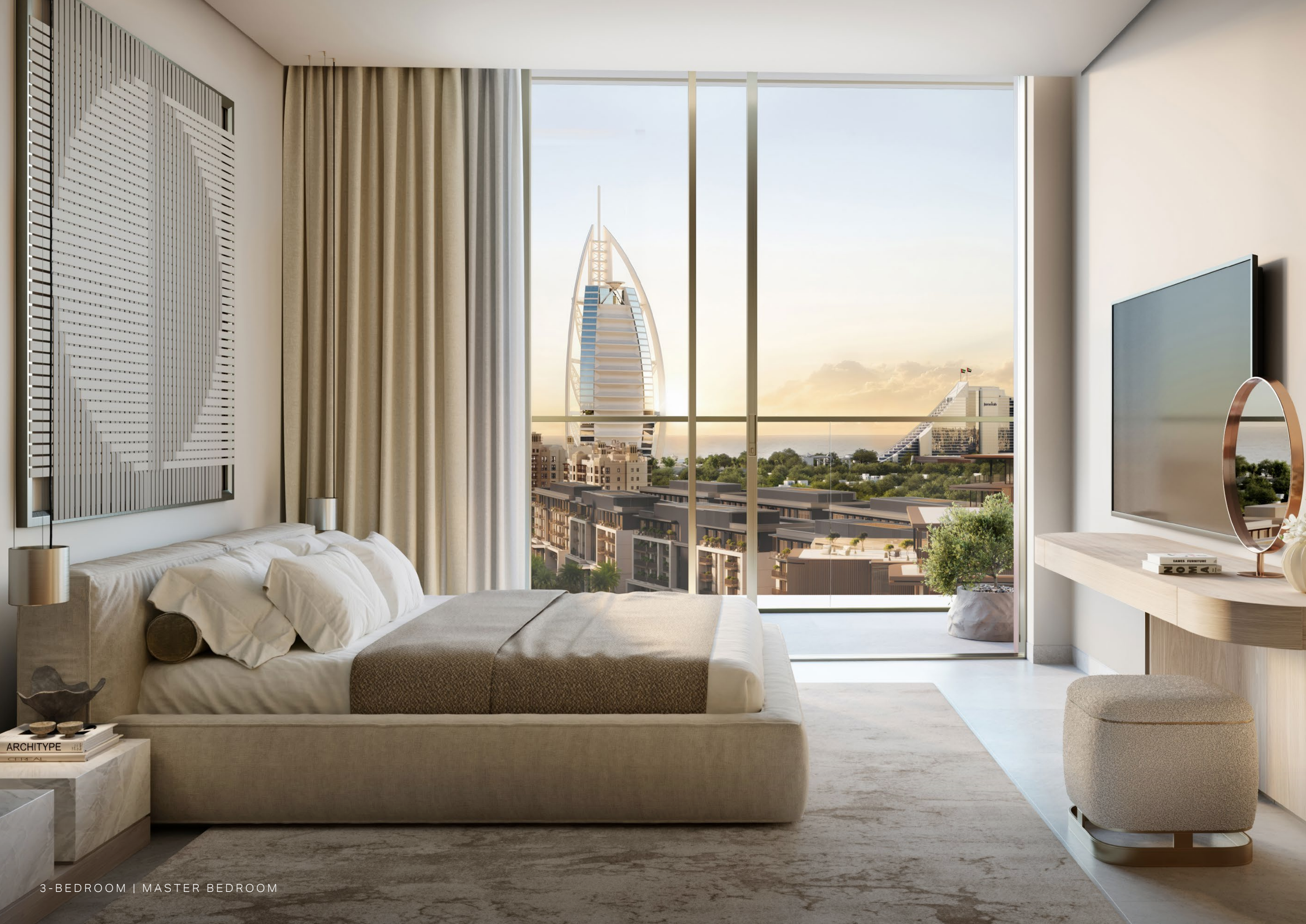
3-BEDROOM | MASTER BEDROOM