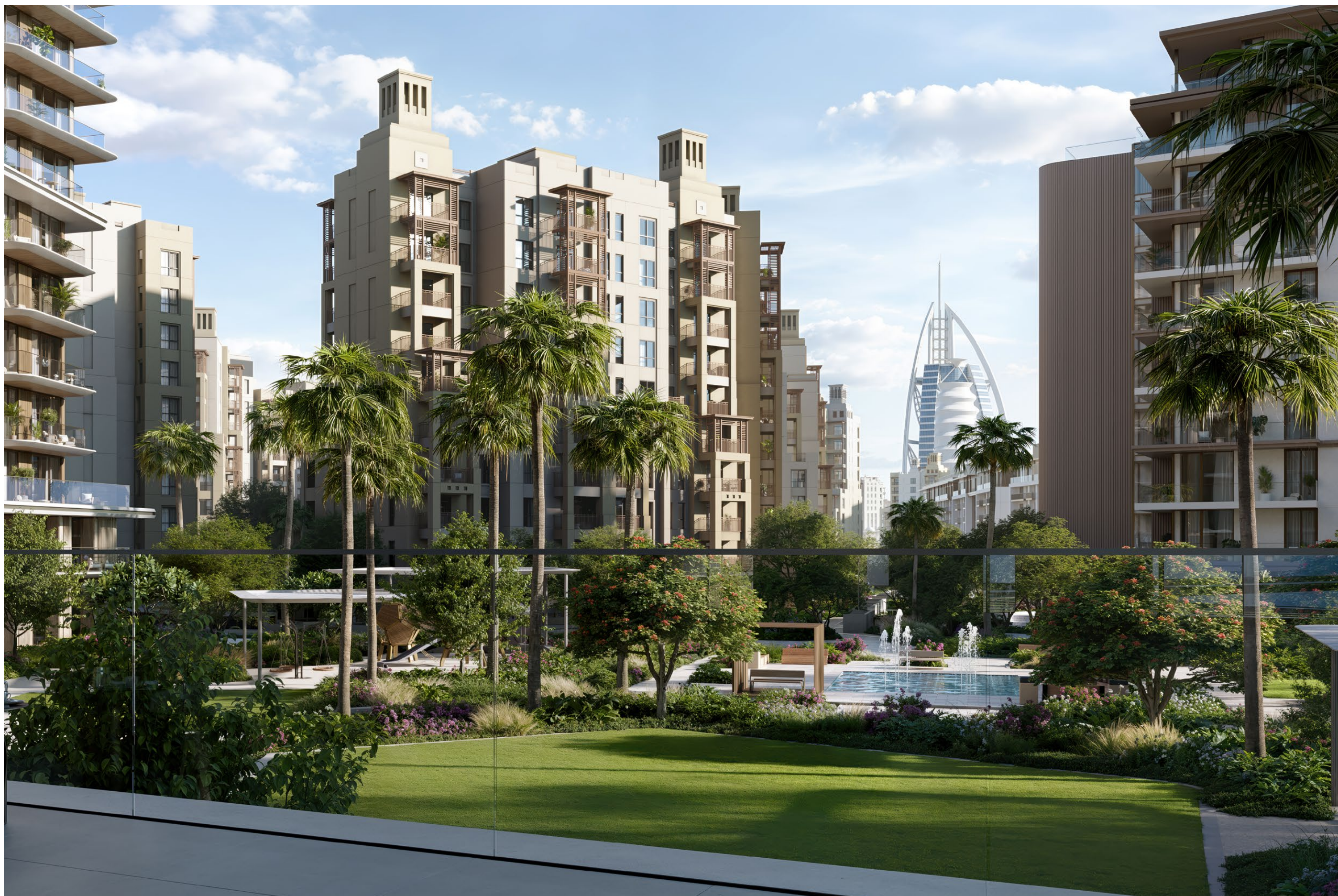
COURTYARD & GARDENS