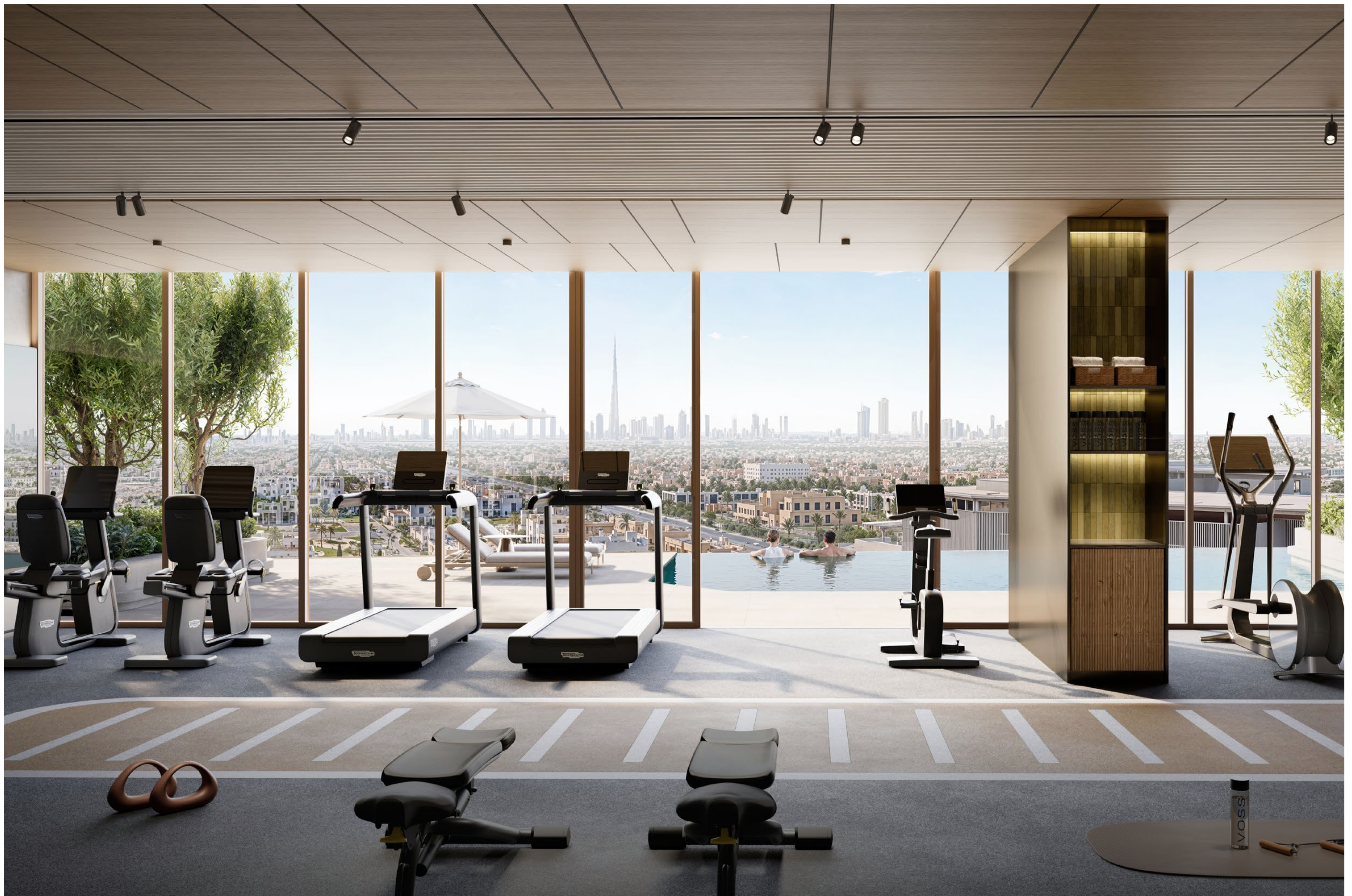
ROOFTOP GYM STUDIO