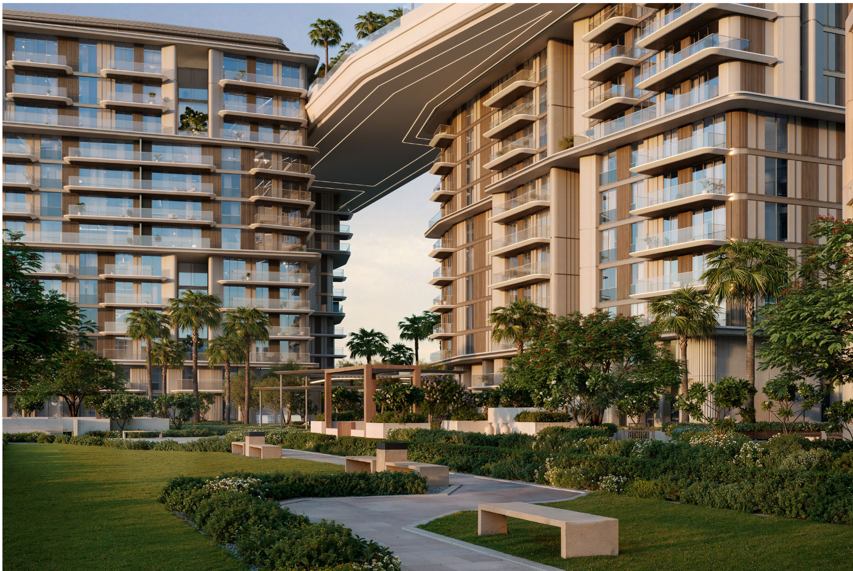
COURTYARD & GARDENS