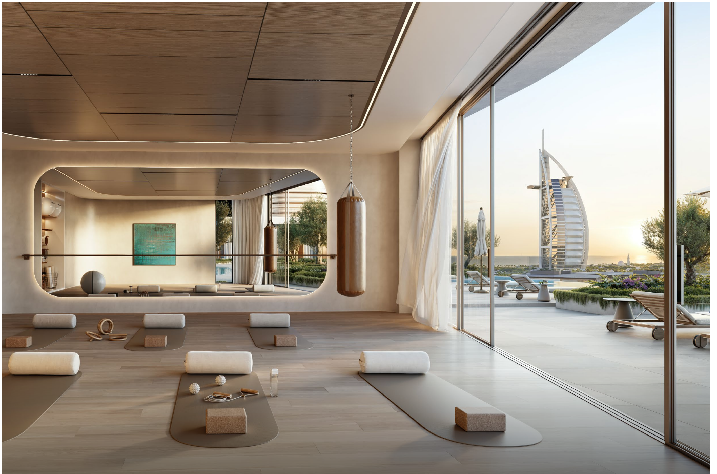
ROOFTOP YOGA STUDIO