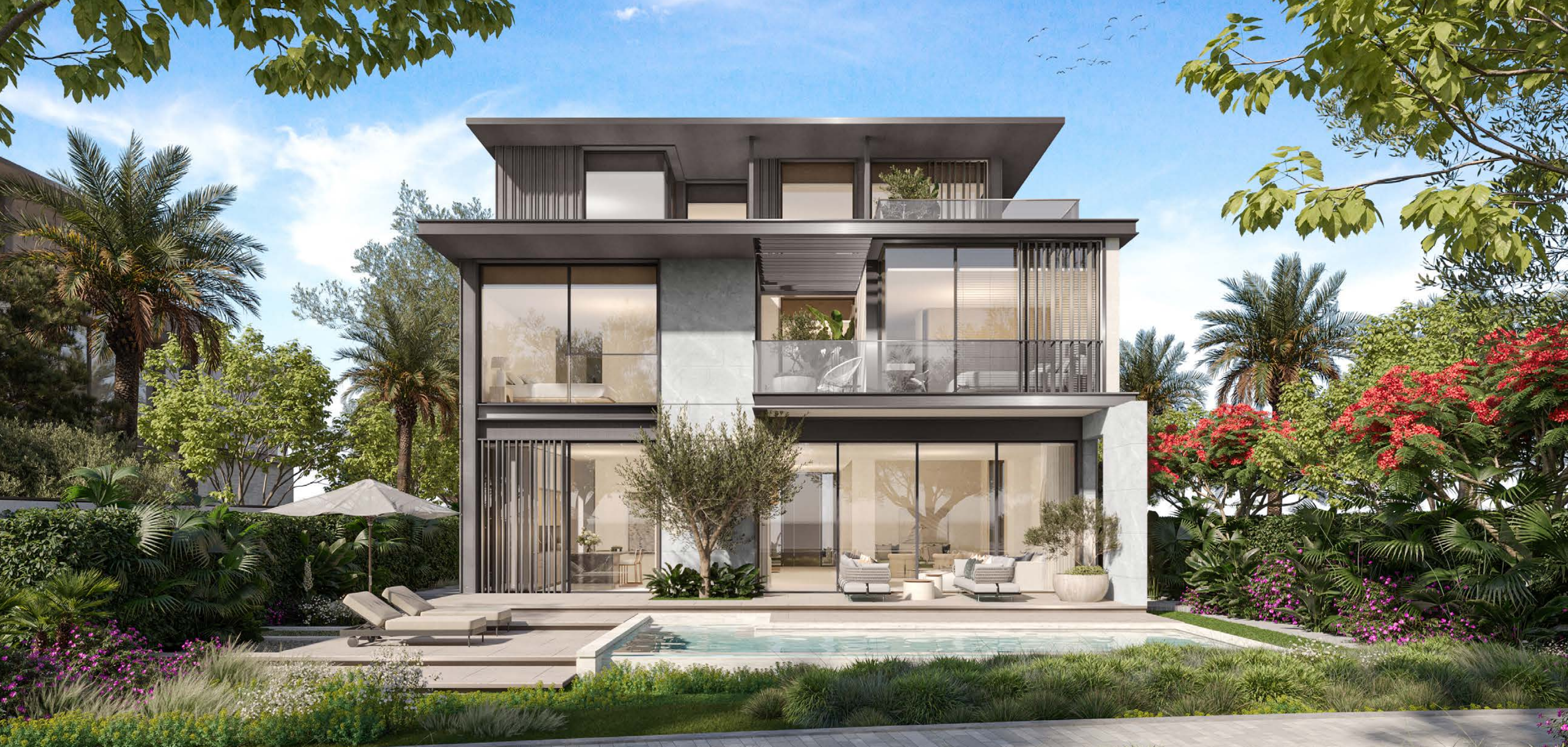
6-BEDROOM VILLA | G+2