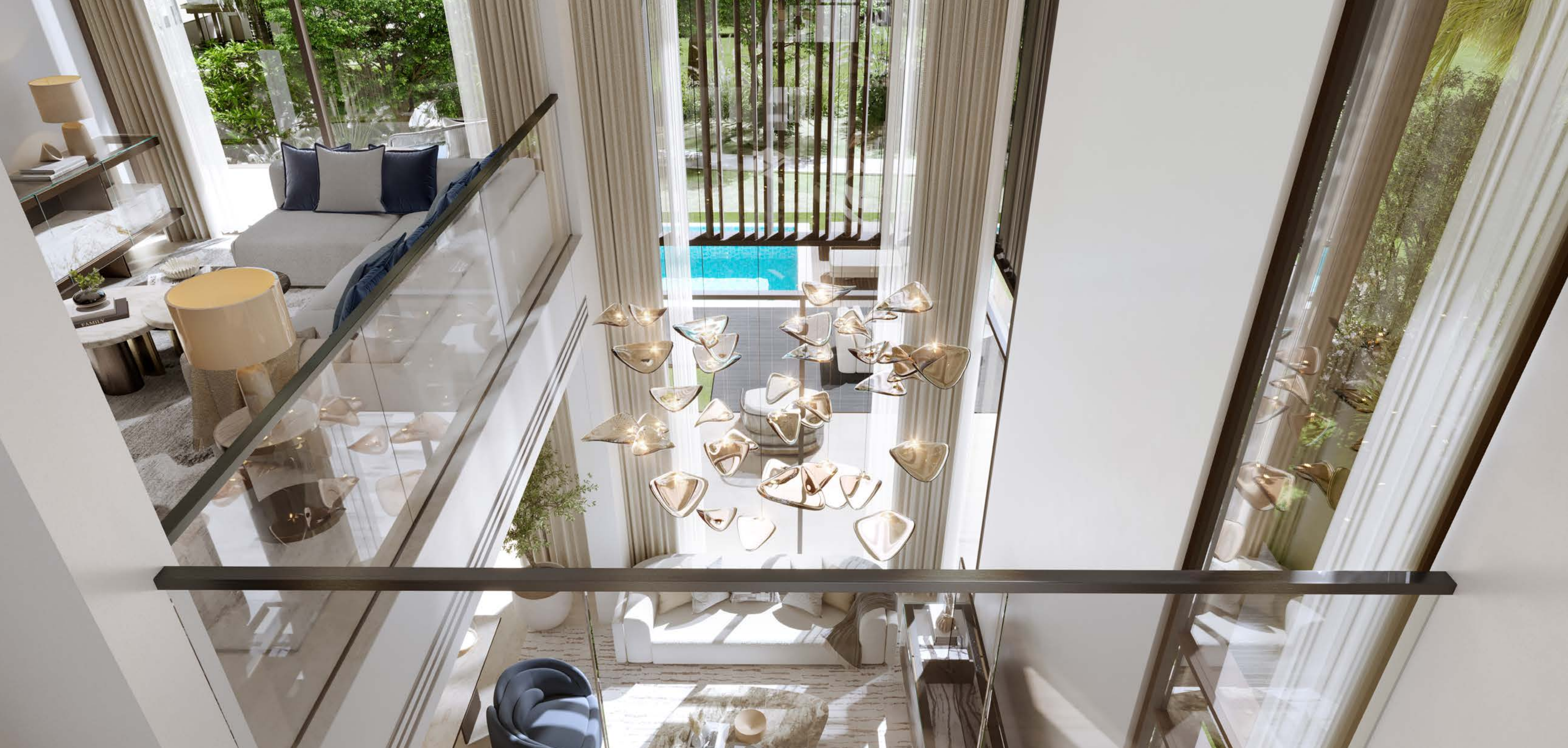
5-BEDROOM VILLA | LIVING ROOM