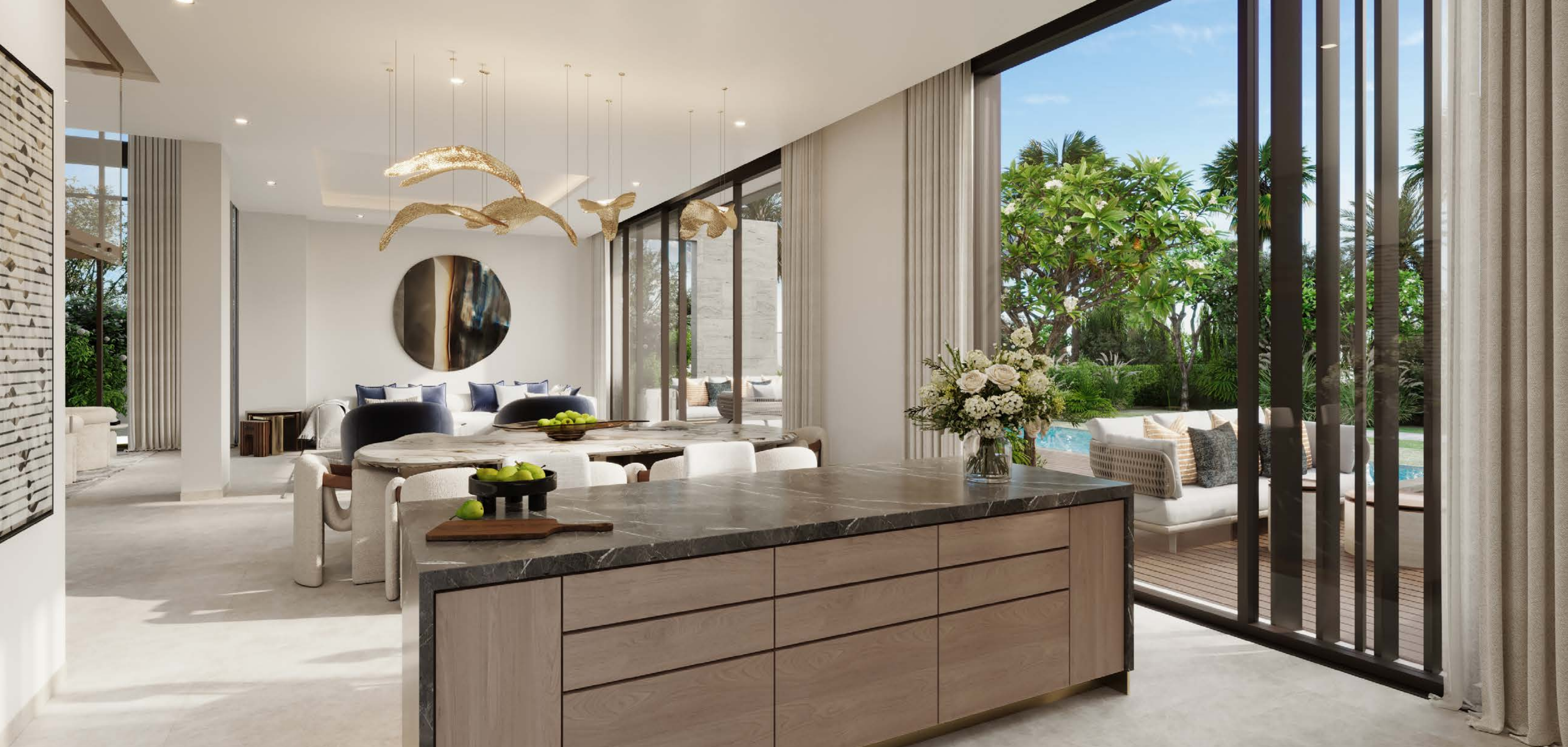
6-BEDROOM VILLA | LIVING & DINING