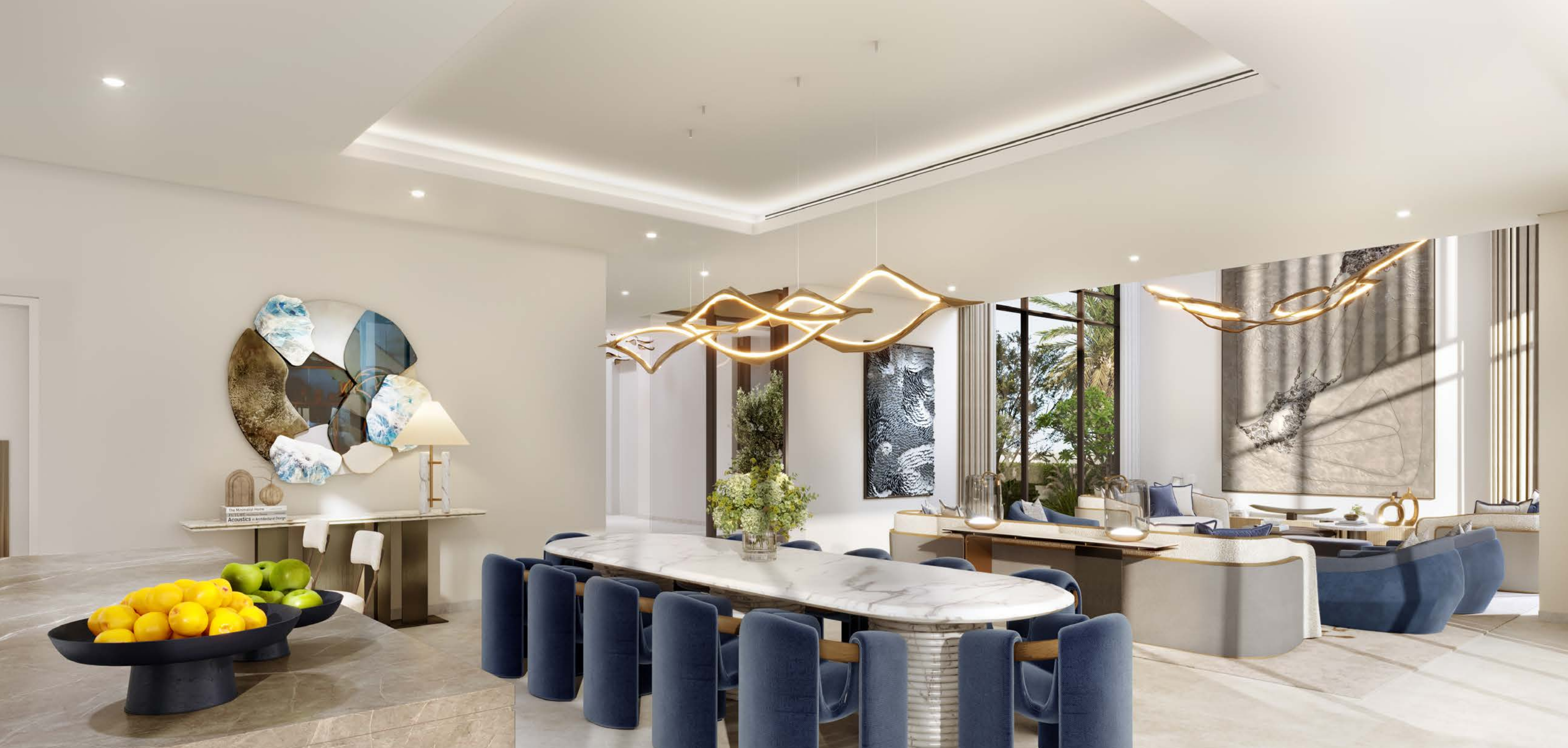
7-BEDROOM VILLA | LIVING & DINING