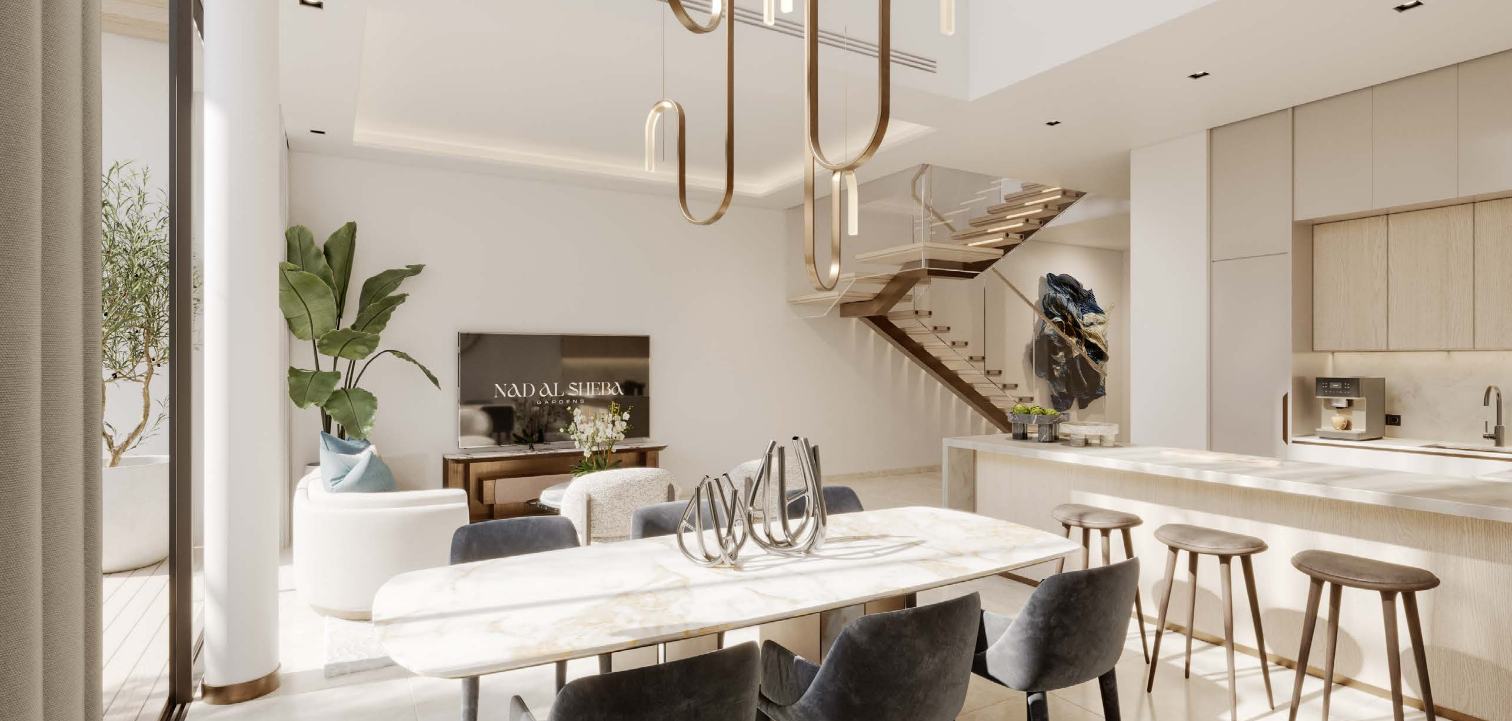
3-BEDROOM TOWNHOUSE | LIVING & DINING