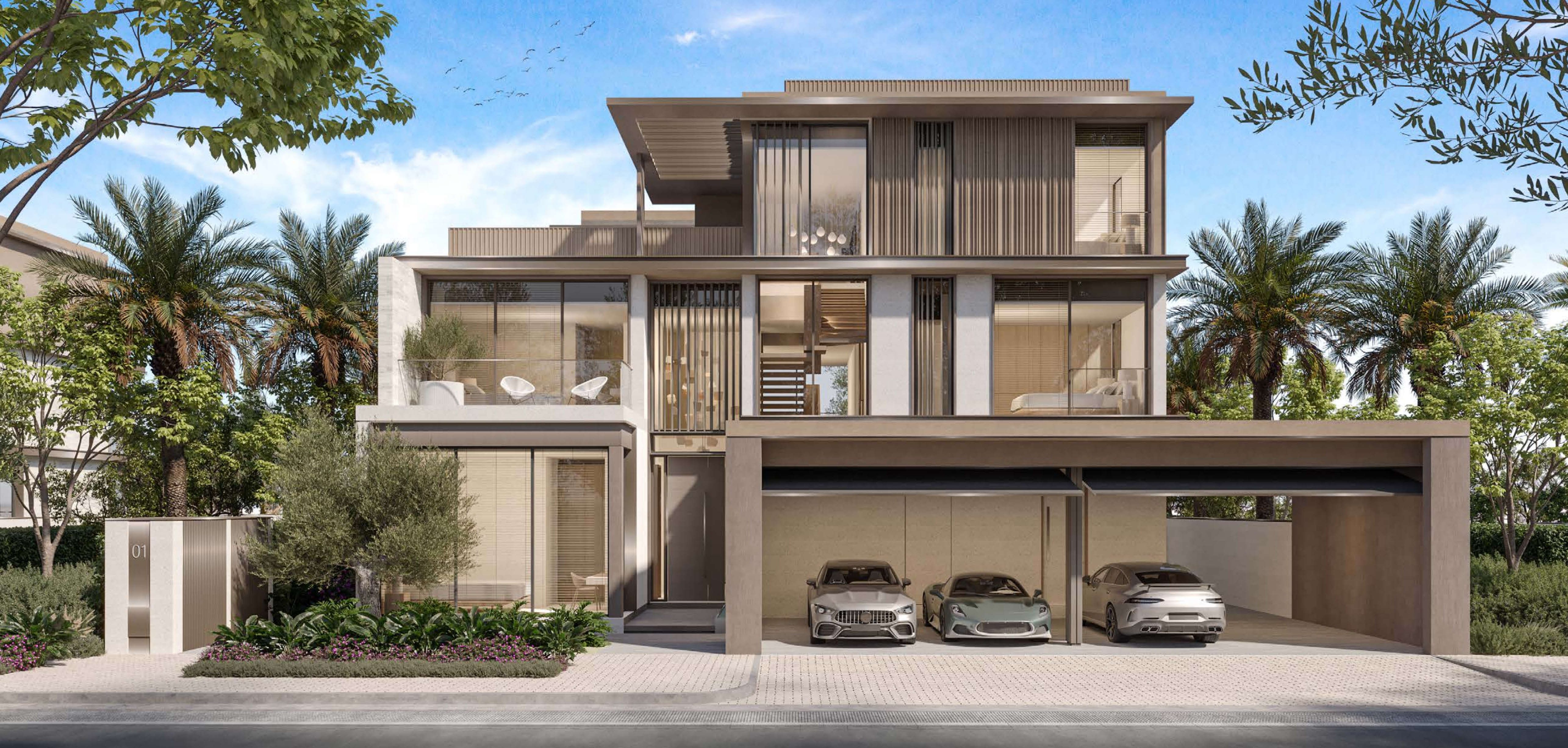
7-BEDROOM VILLA | G+2