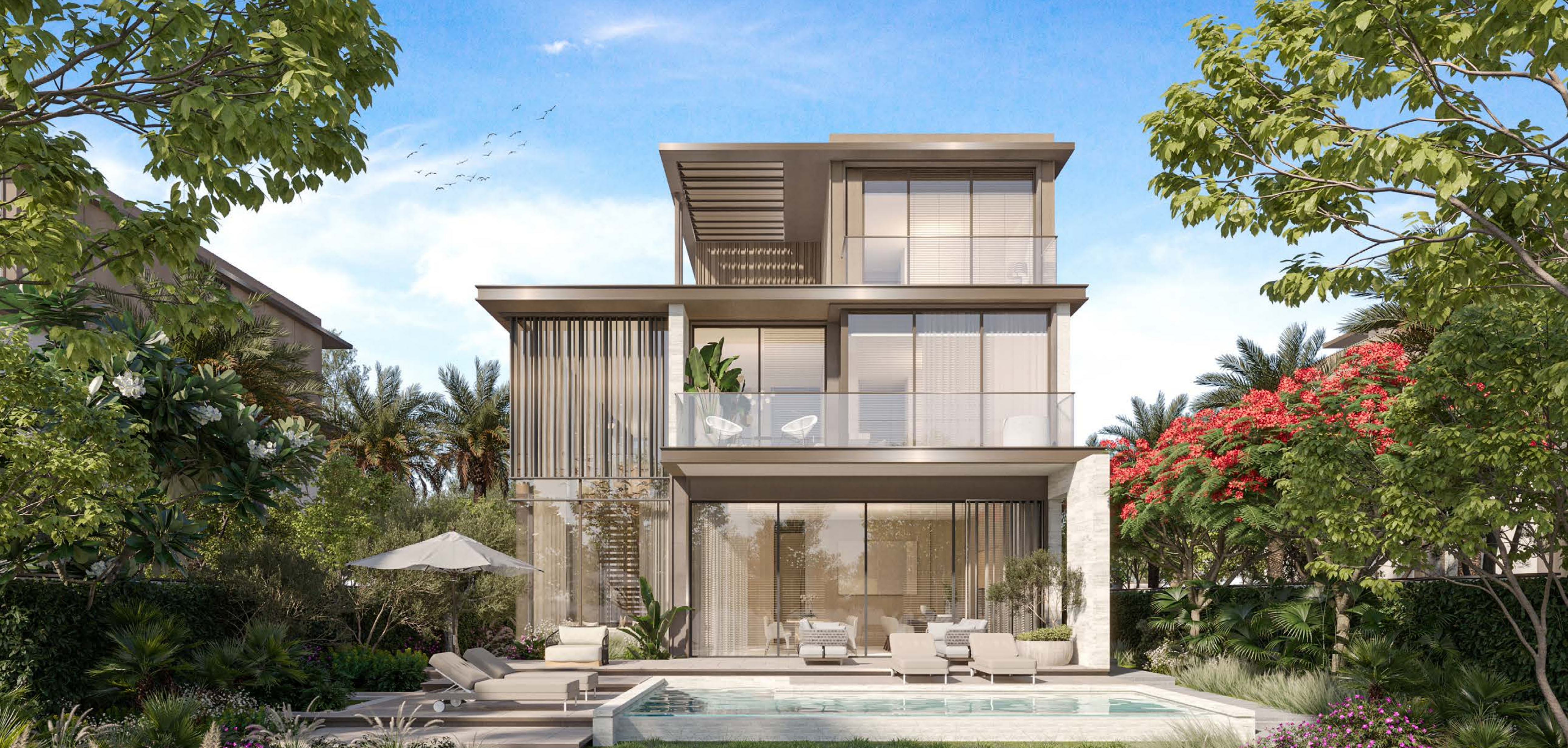
5-BEDROOM VILLA | G+2