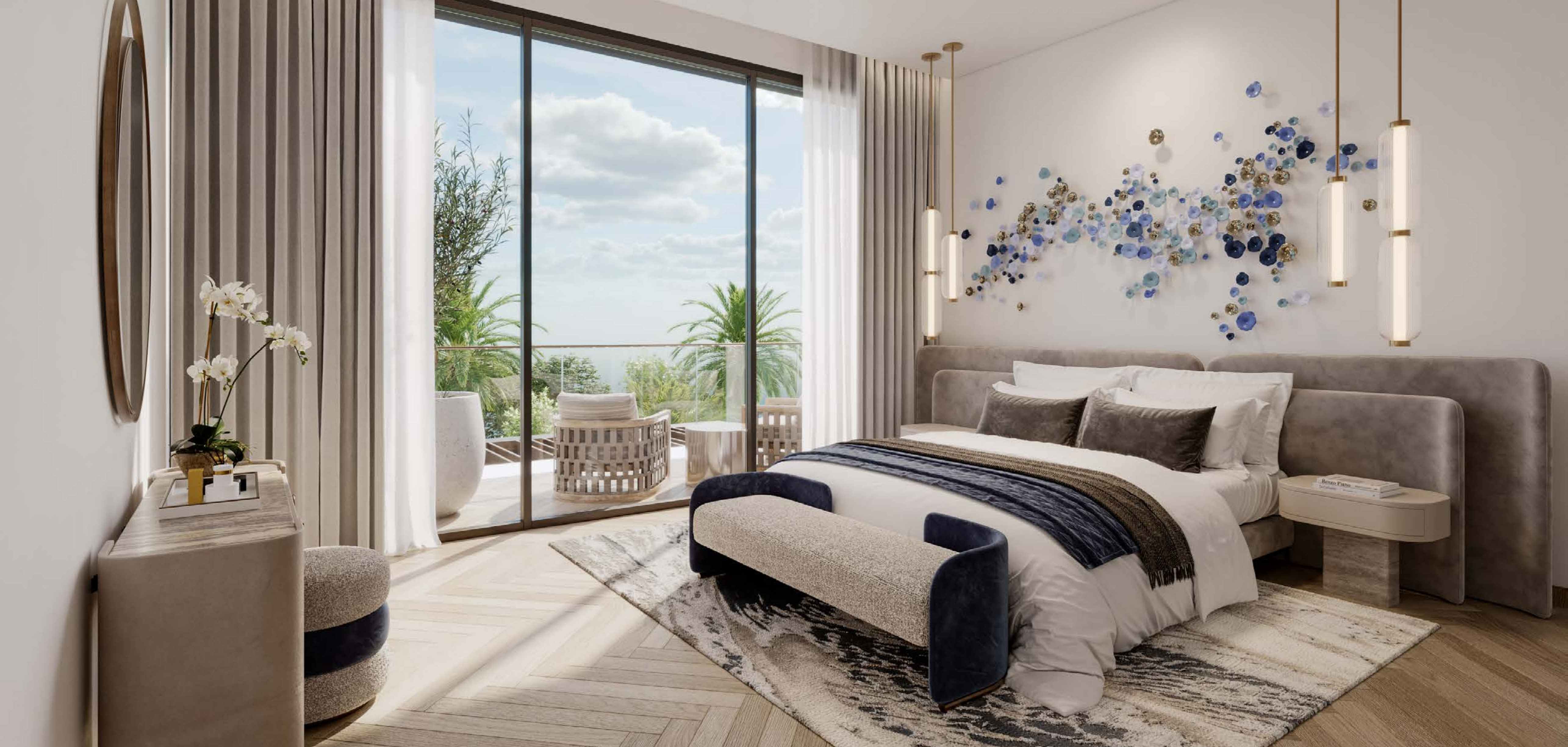
4-BEDROOM VILLA | BEDROOM