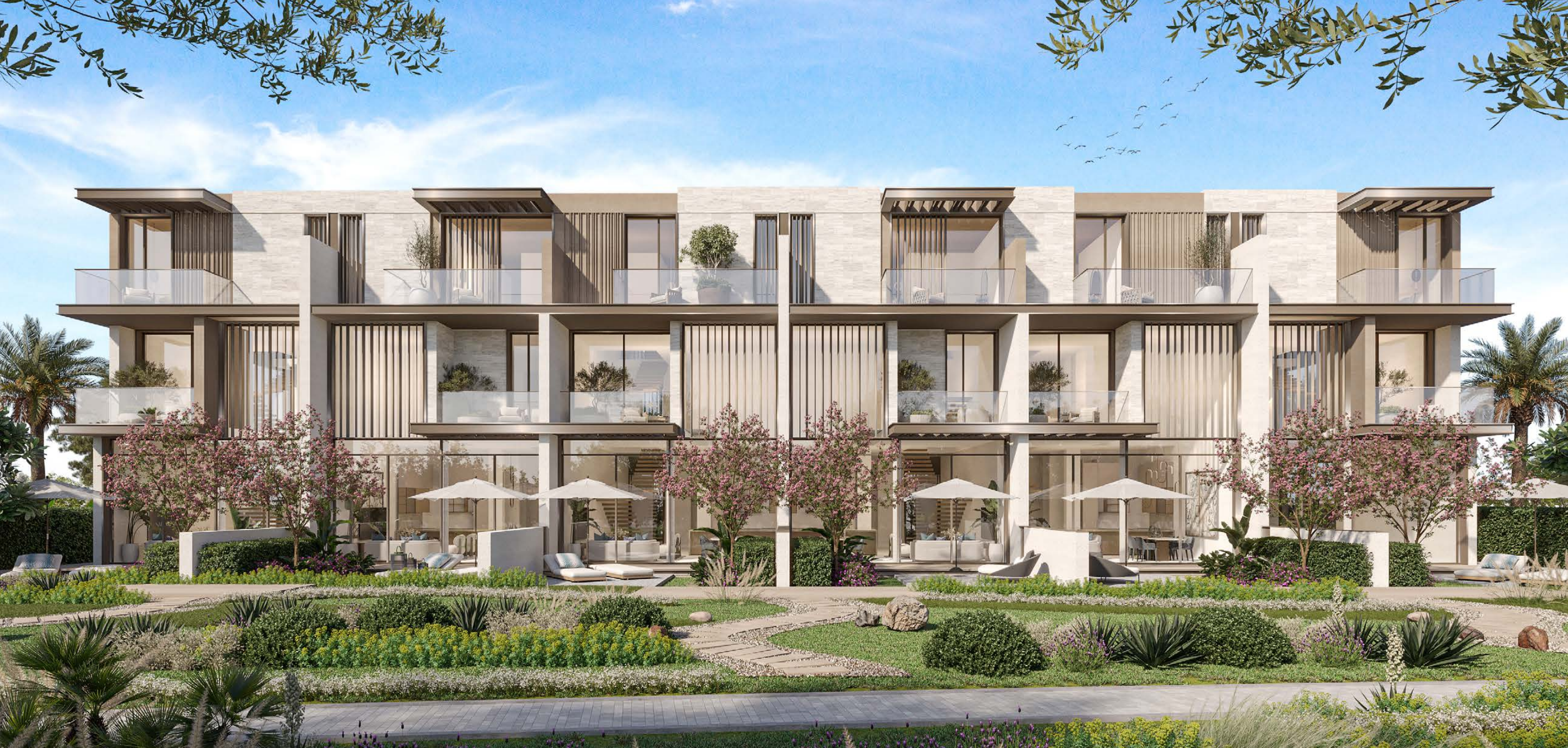
3-BEDROOM TOWNHOUSE | G+2 | 6PLEX