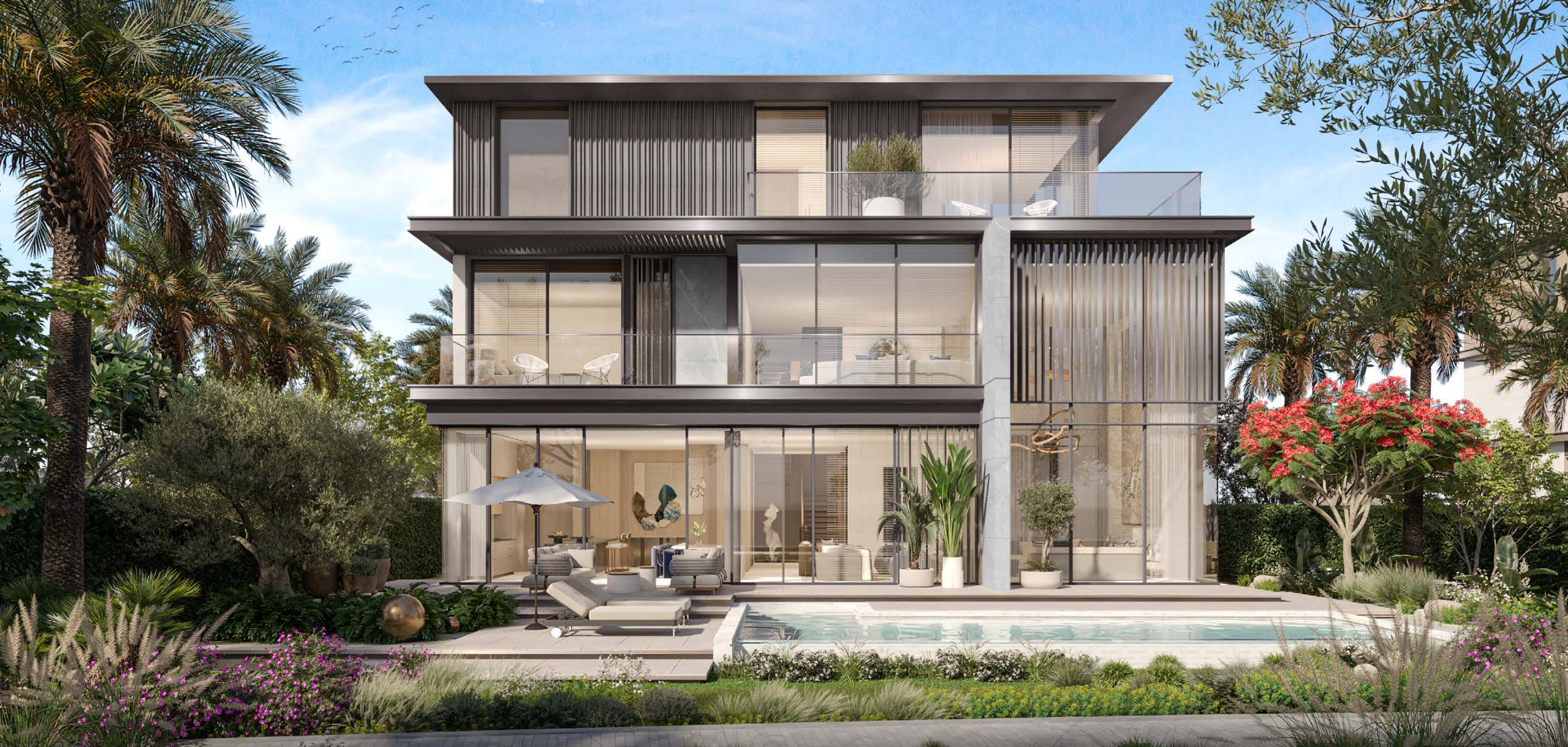
7-BEDROOM VILLA | G+2