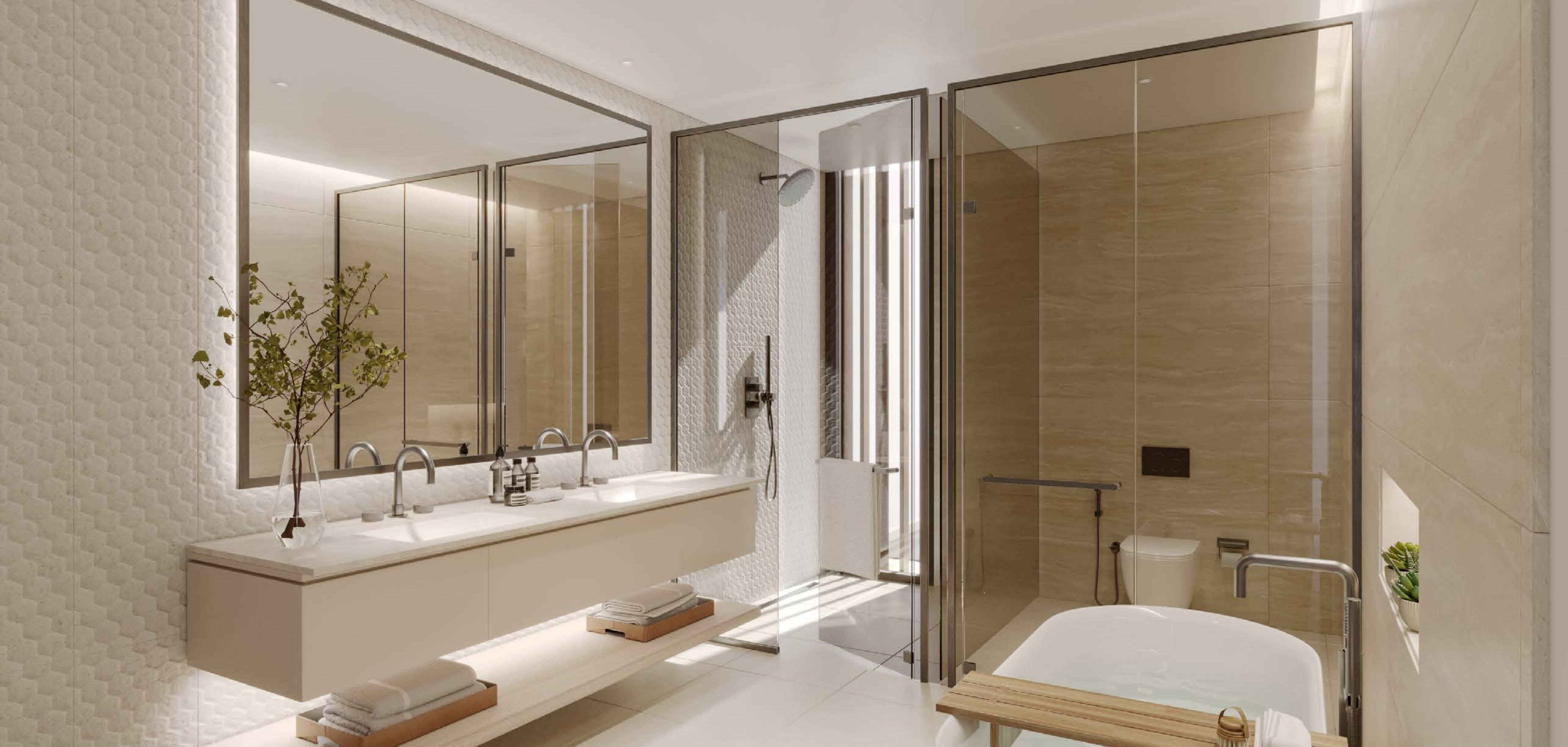
3-BEDROOM TOWNHOUSE | BATHROOM