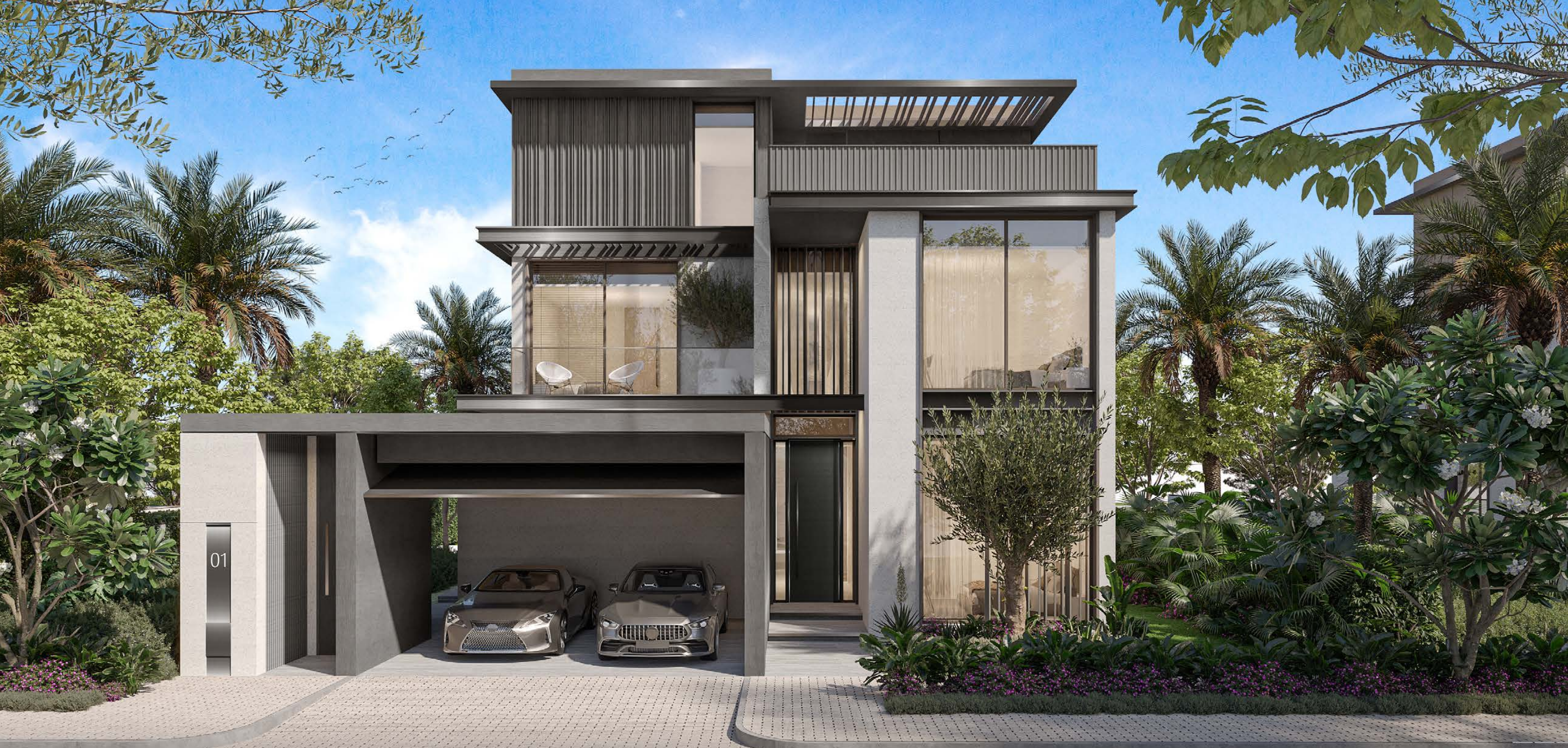
4-BEDROOM VILLA | G+2