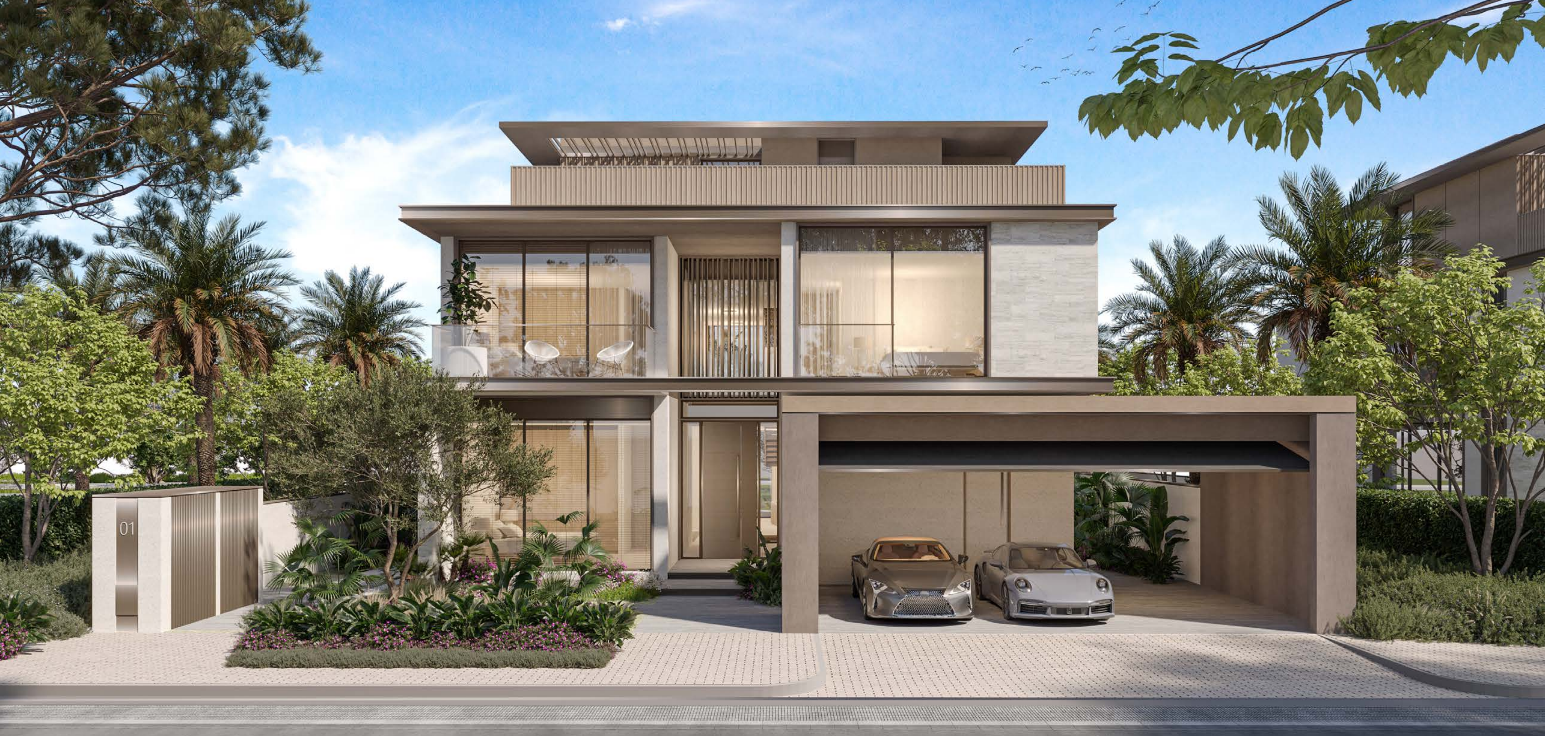
6-BEDROOM VILLA | G+2