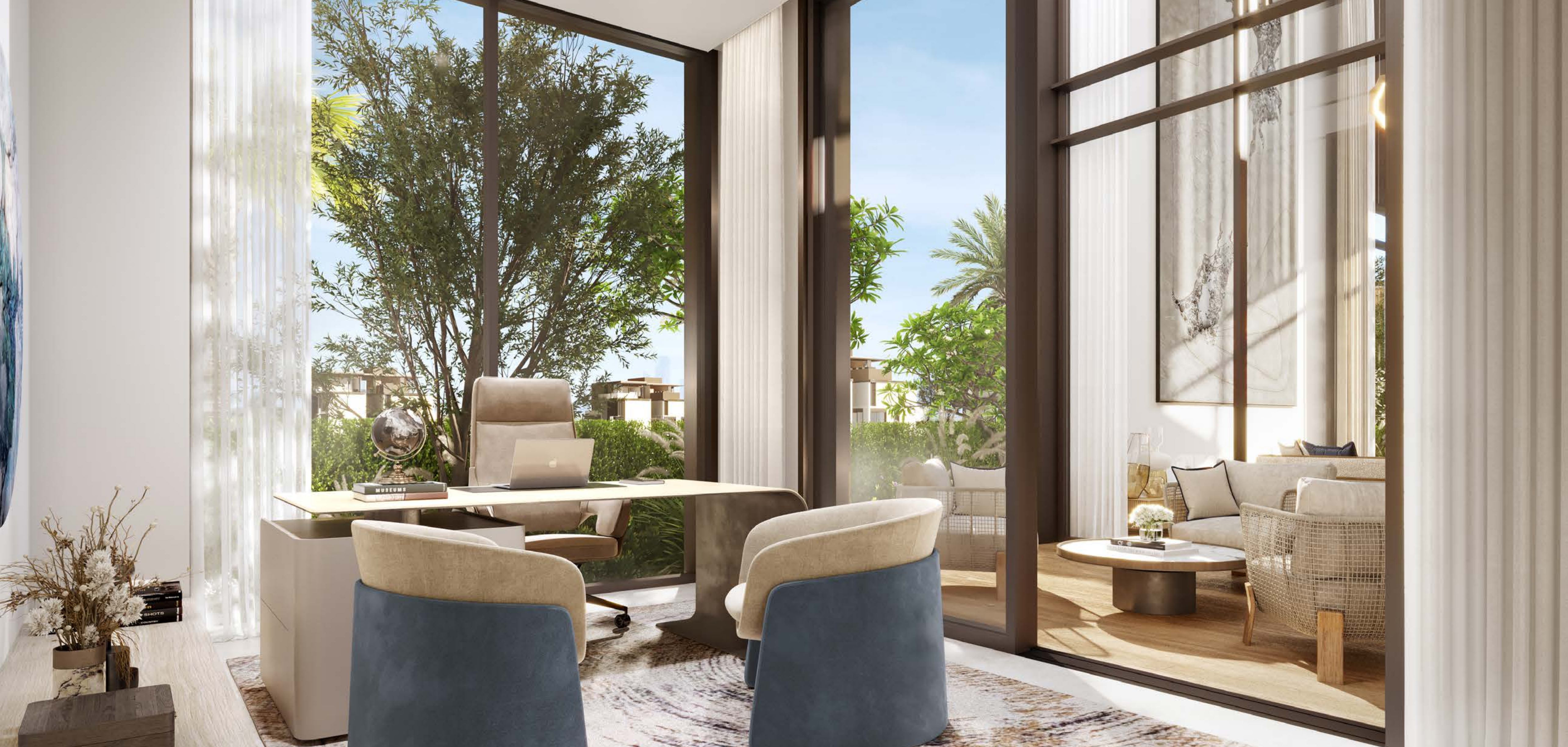
7-BEDROOM VILLA | OFFICE