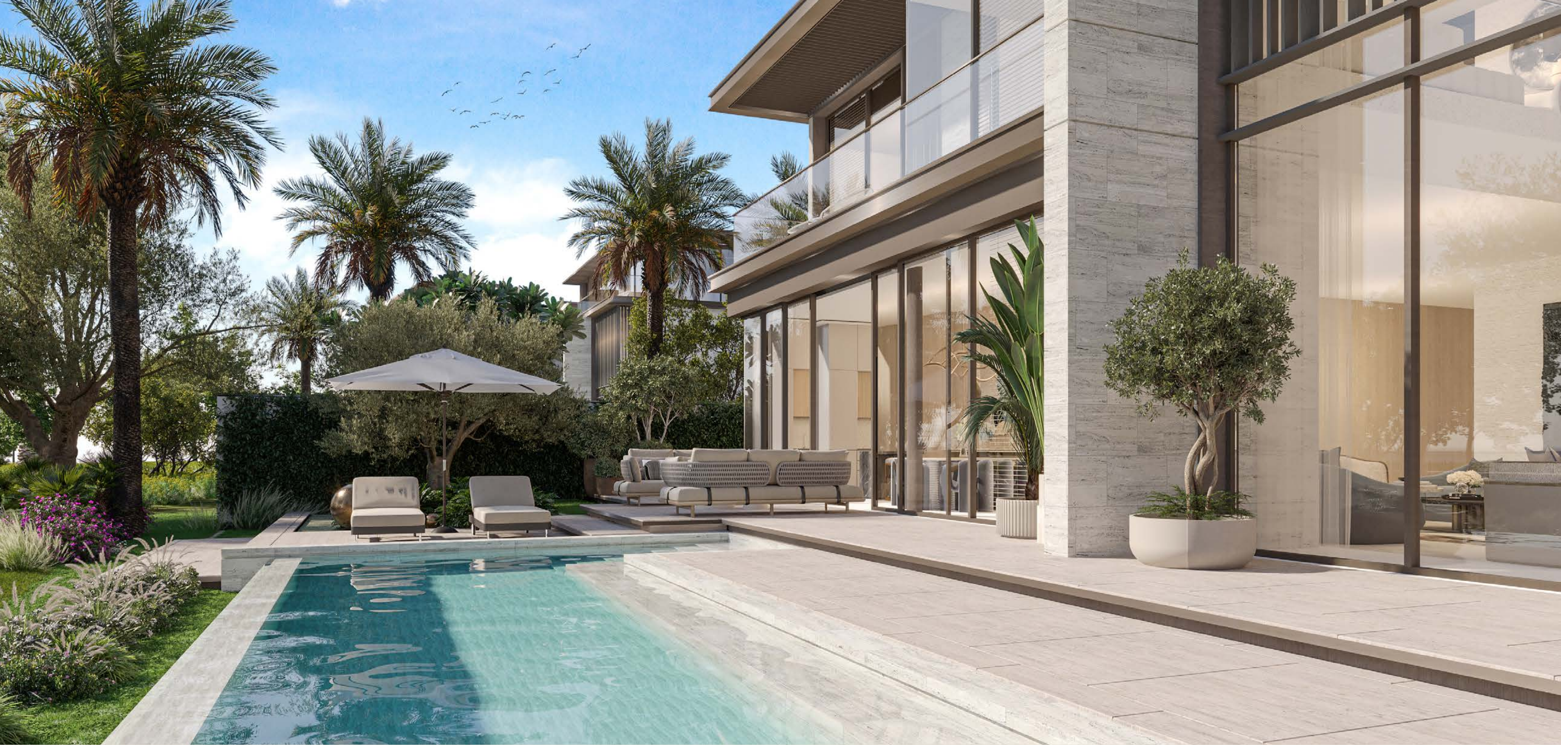
7-BEDROOM VILLA | G+2