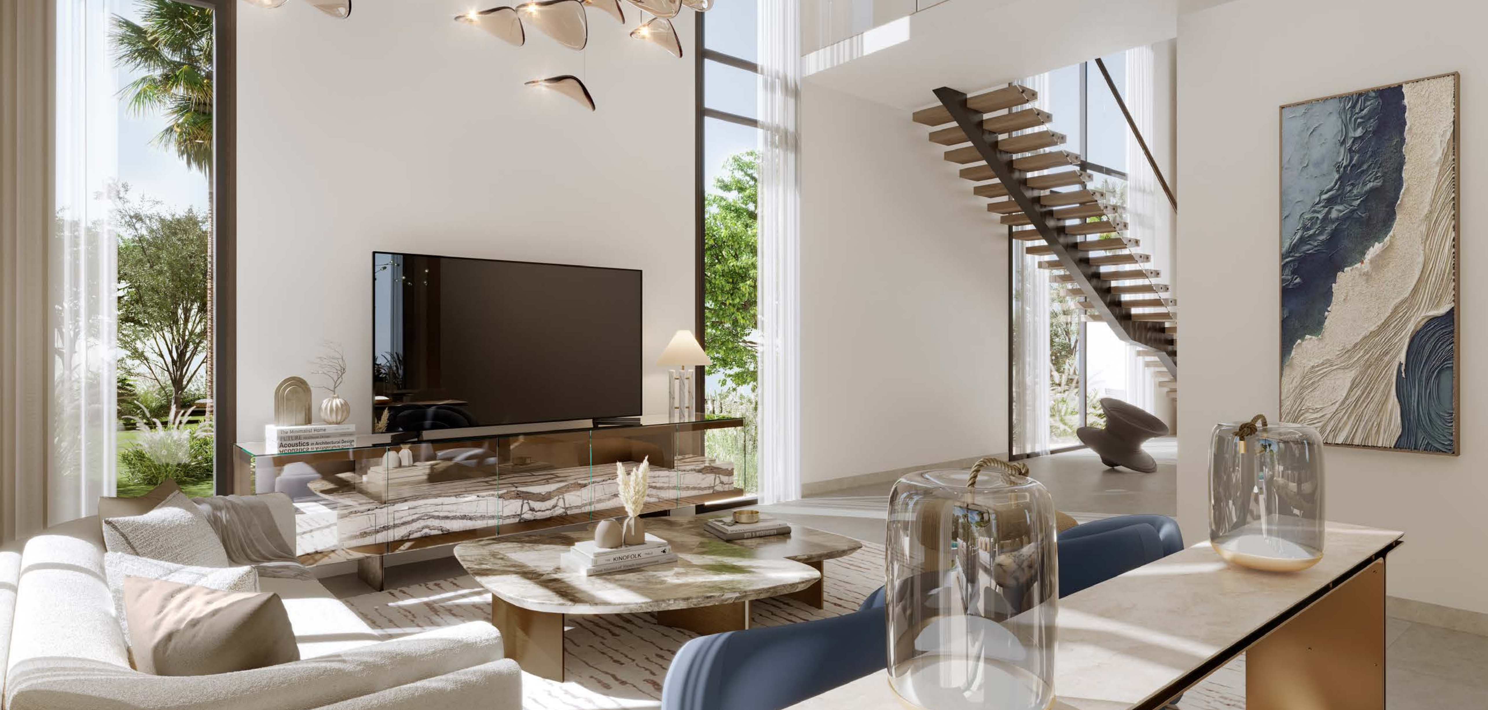
5-BEDROOM VILLA | LIVING ROOM