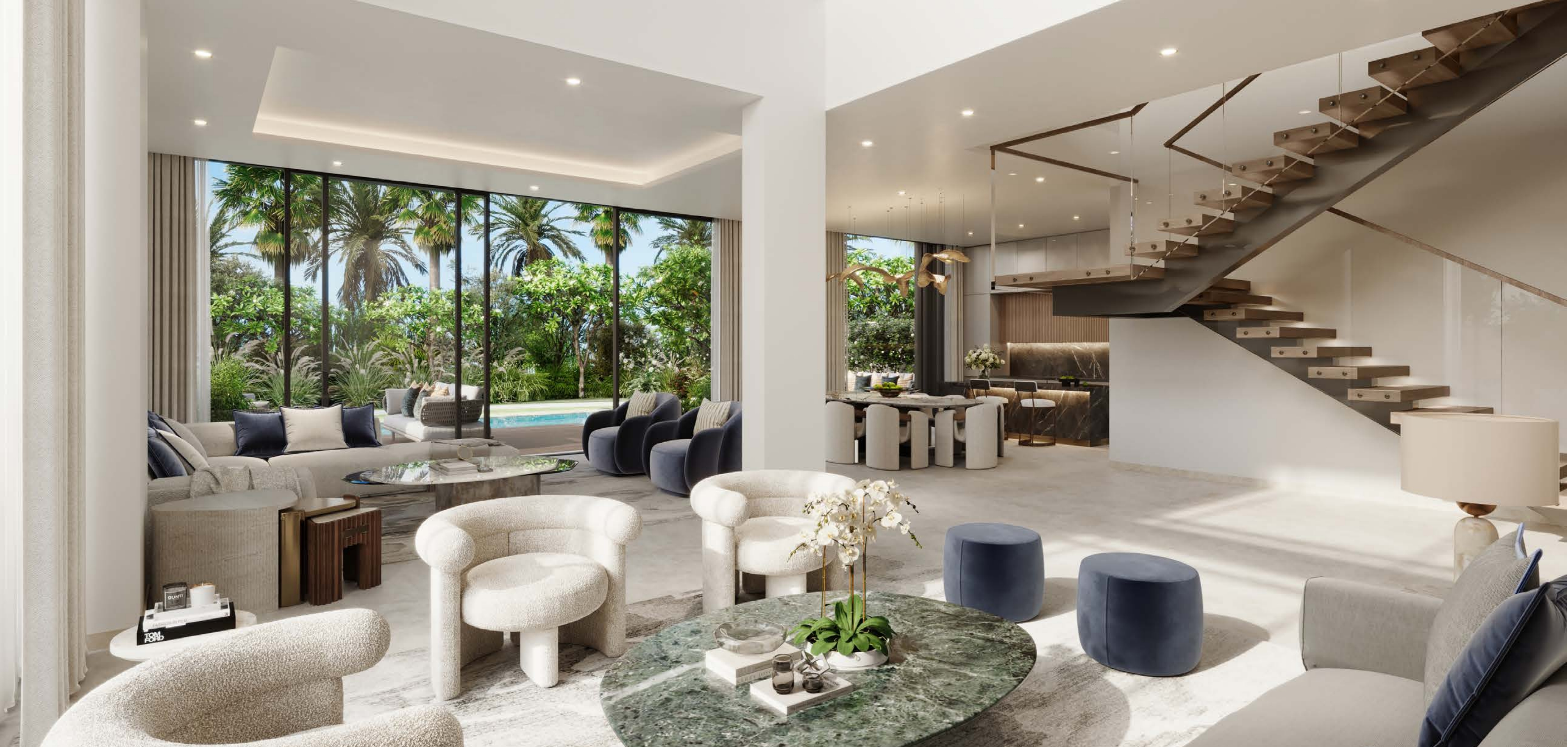
6-BEDROOM VILLA | LIVING & DINING