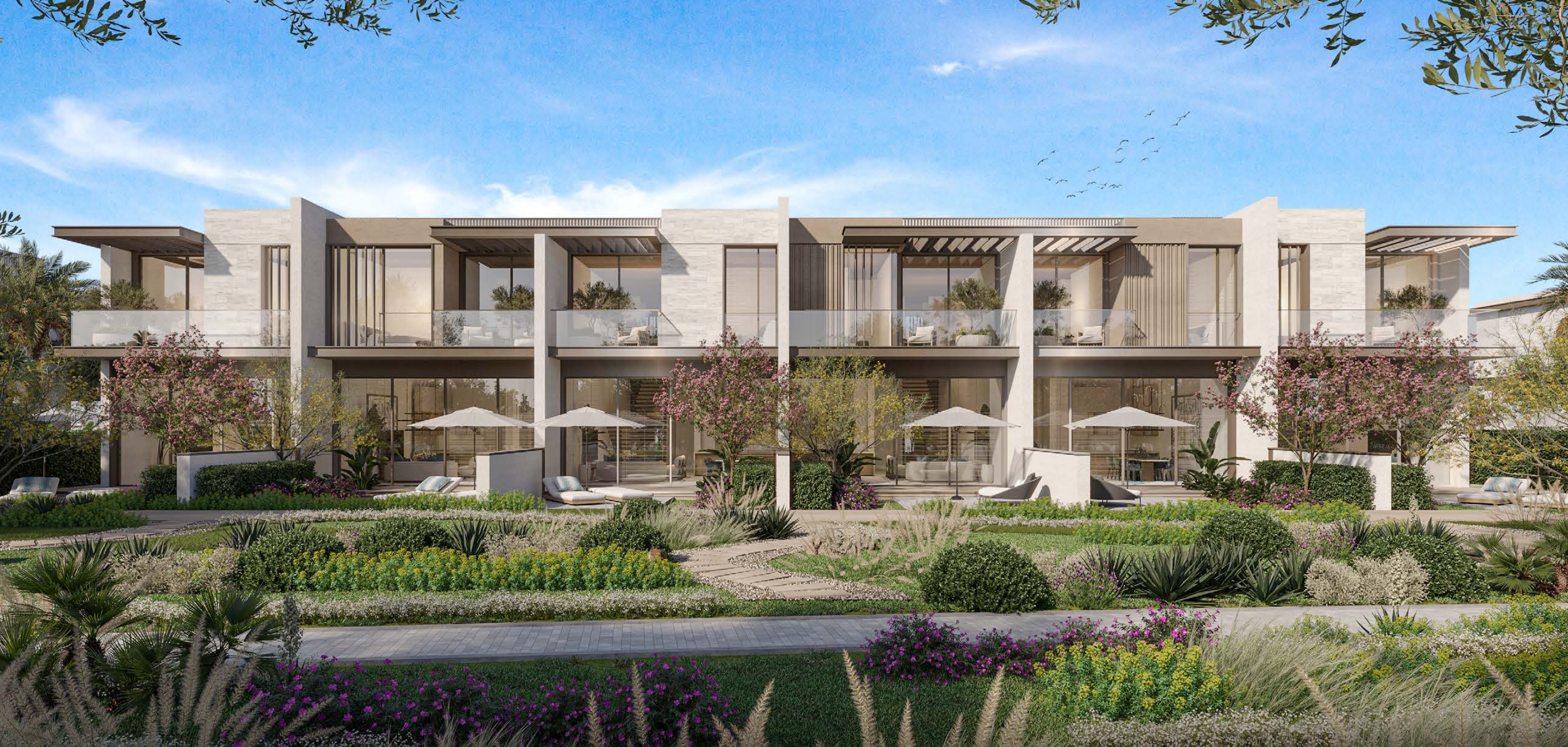
3-BEDROOM TOWNHOUSE | G+1 | 6PLEX