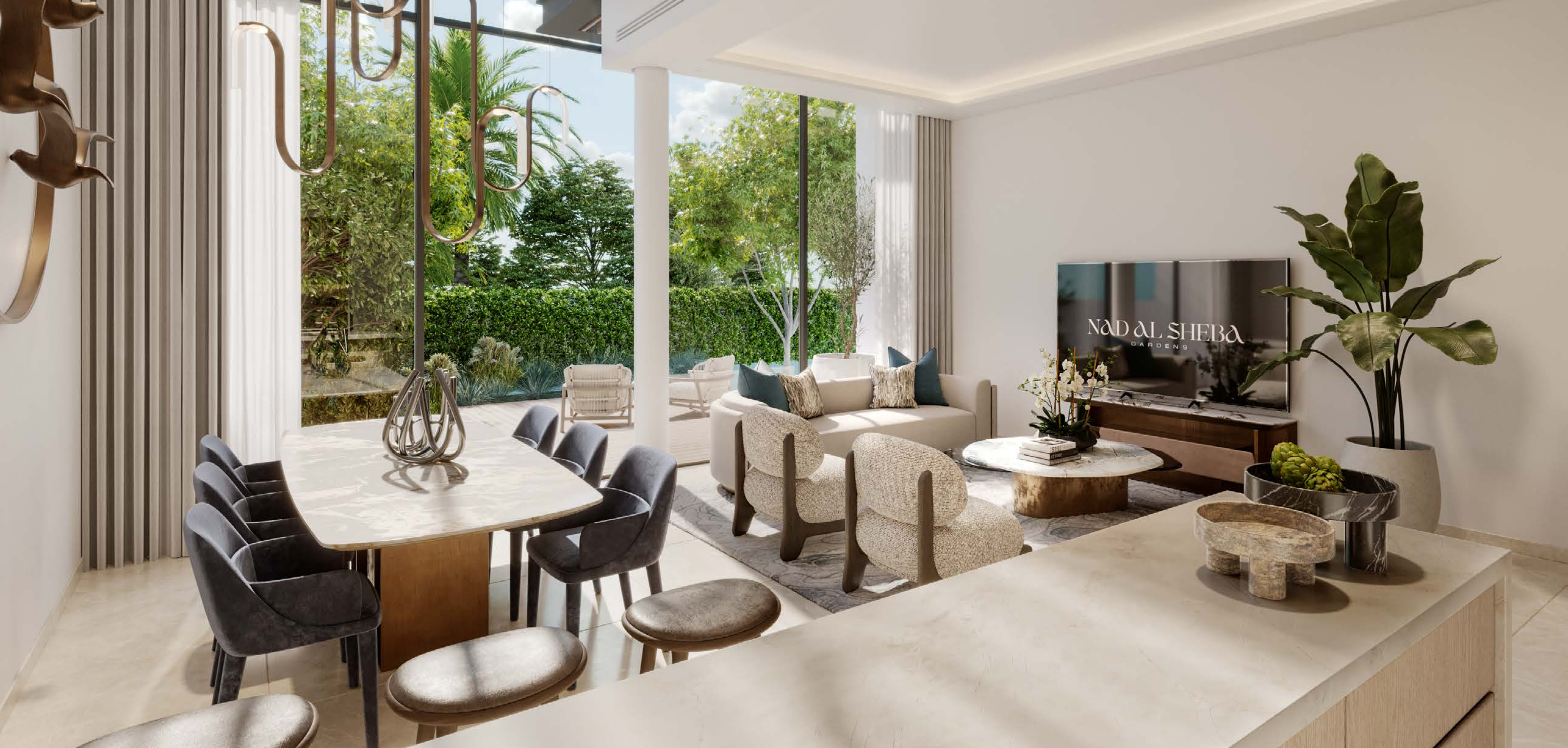
3-BEDROOM TOWNHOUSE | LIVING & DINING