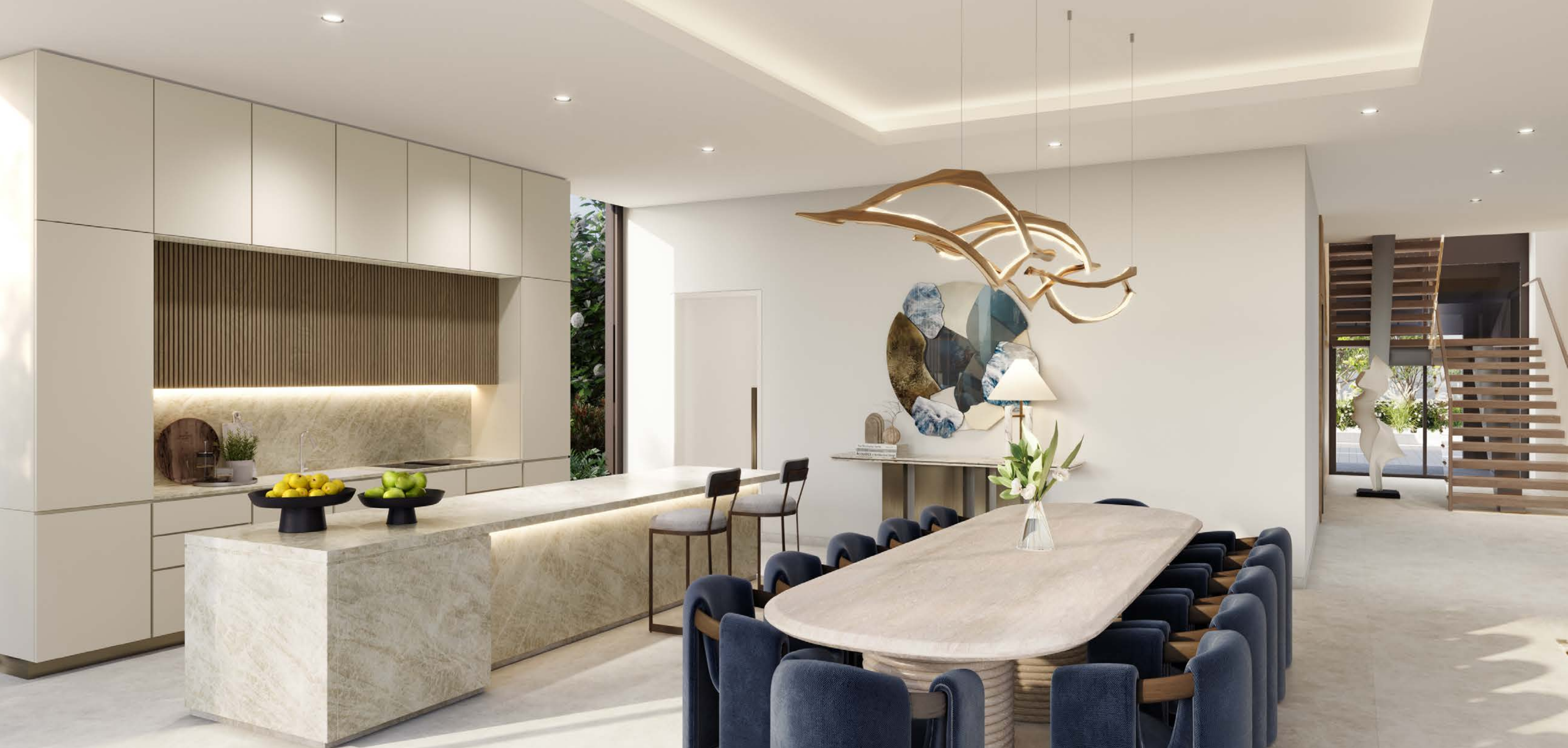
7-BEDROOM VILLA | KITCHEN & DINING