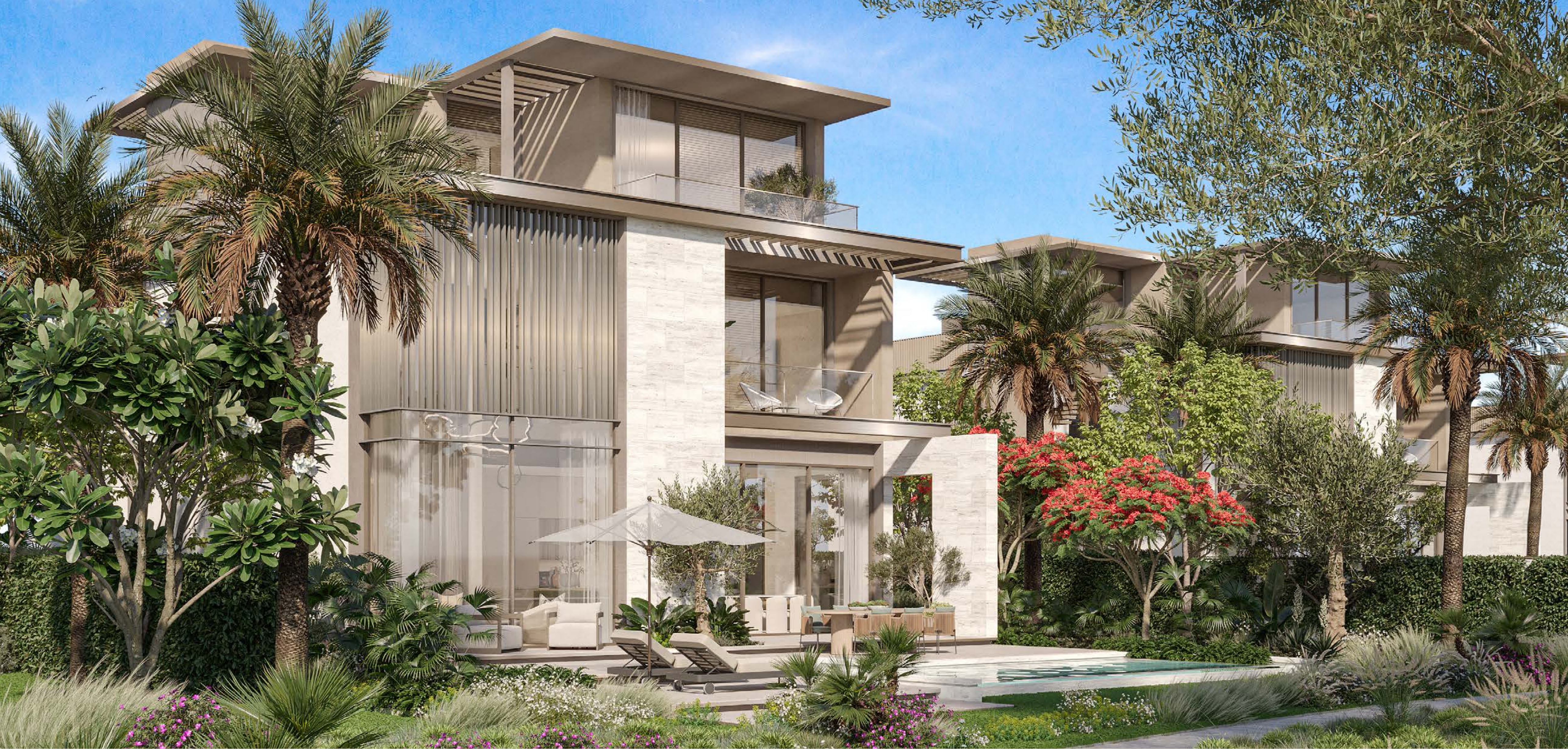
4-BEDROOM VILLA | G+2