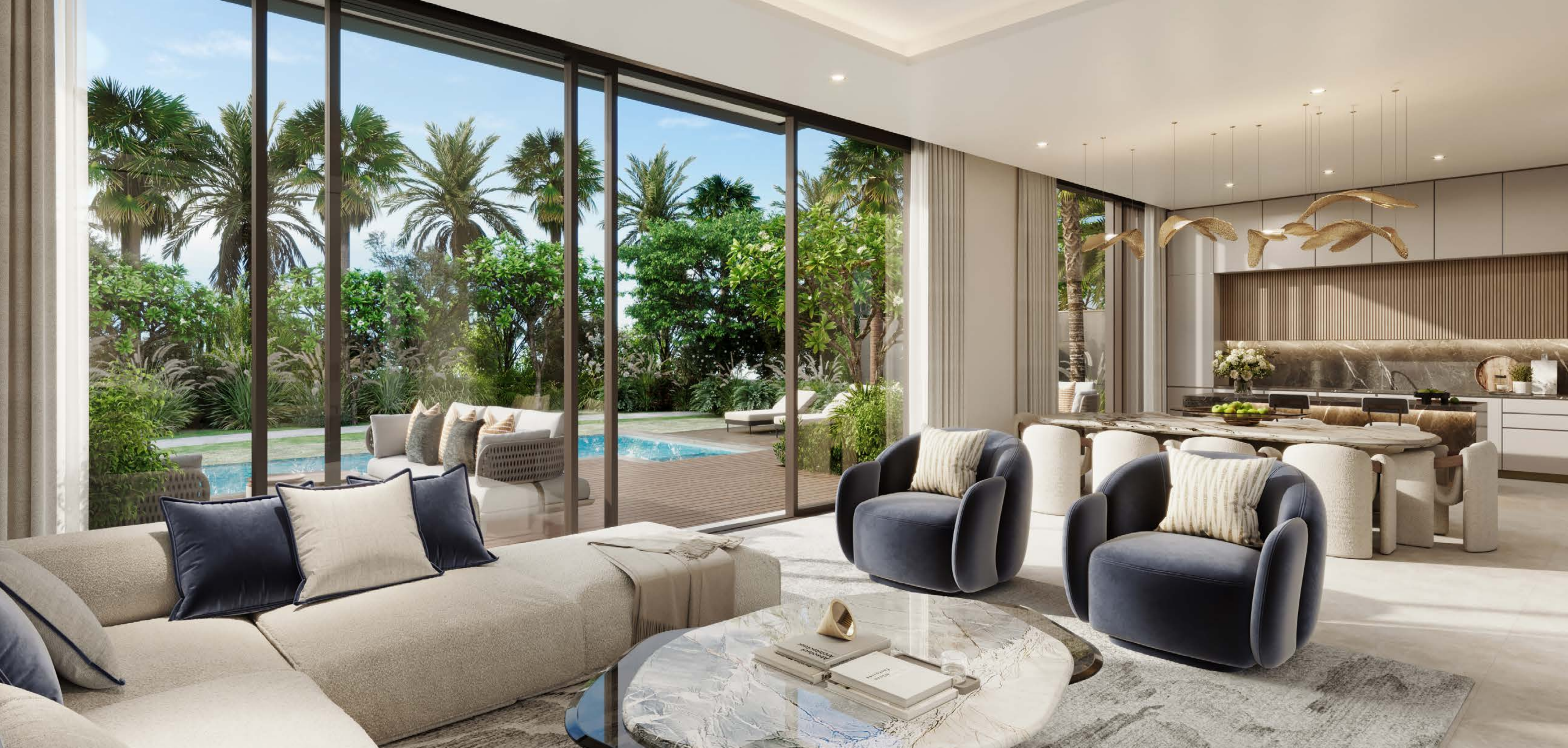
6-BEDROOM VILLA | LIVING & DINING