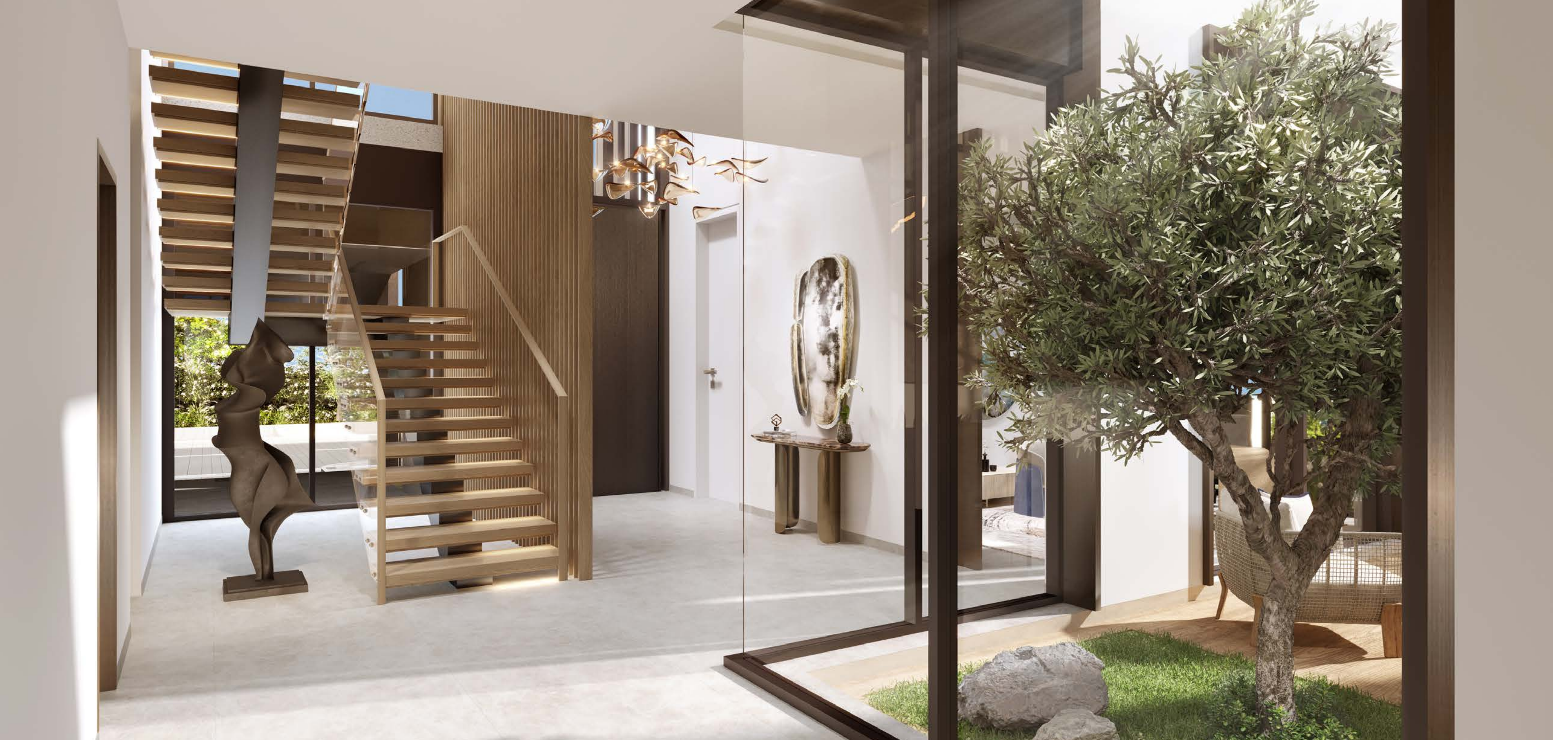
7-BEDROOM VILLA | STAIRCASE