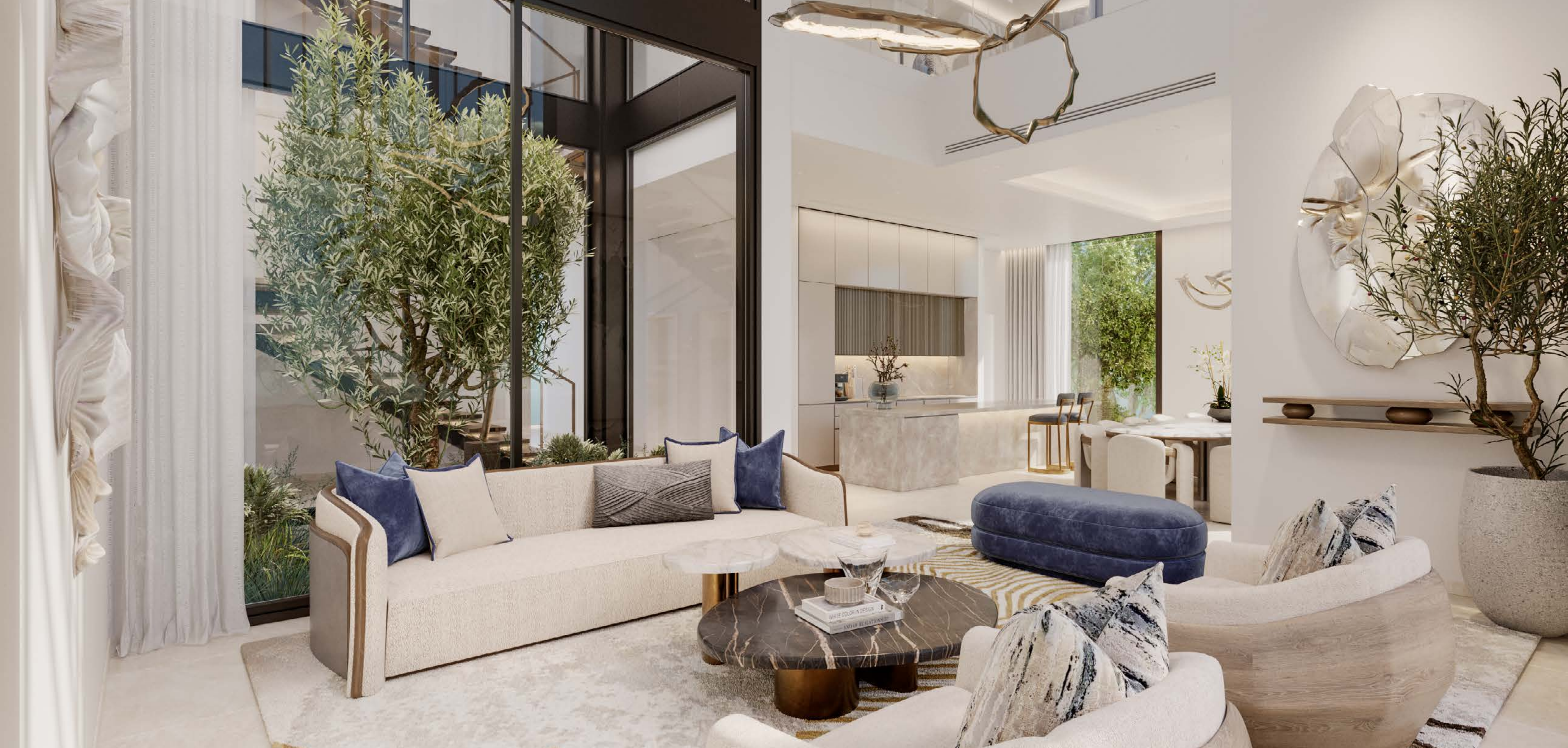
4-BEDROOM VILLA | LIVING ROOM