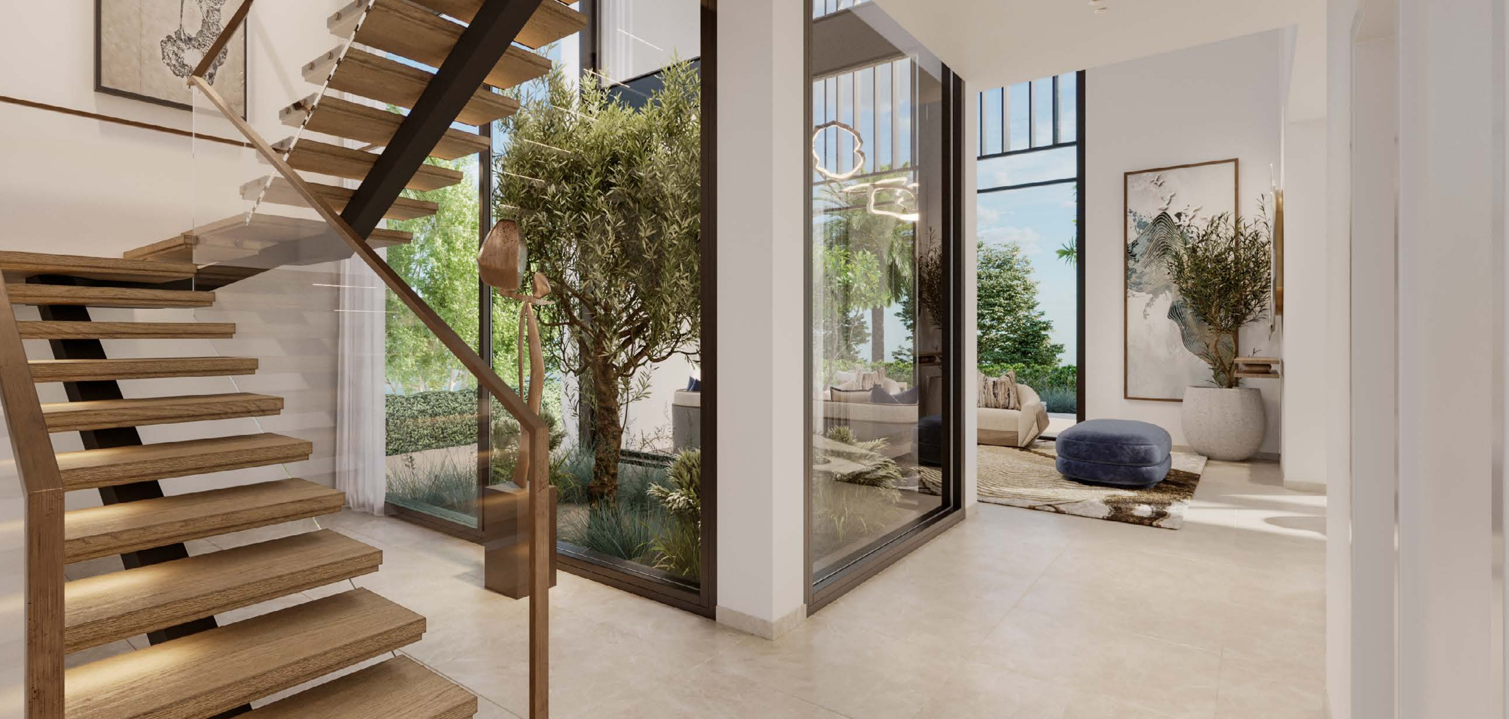
4-BEDROOM VILLA | STAIRCASE