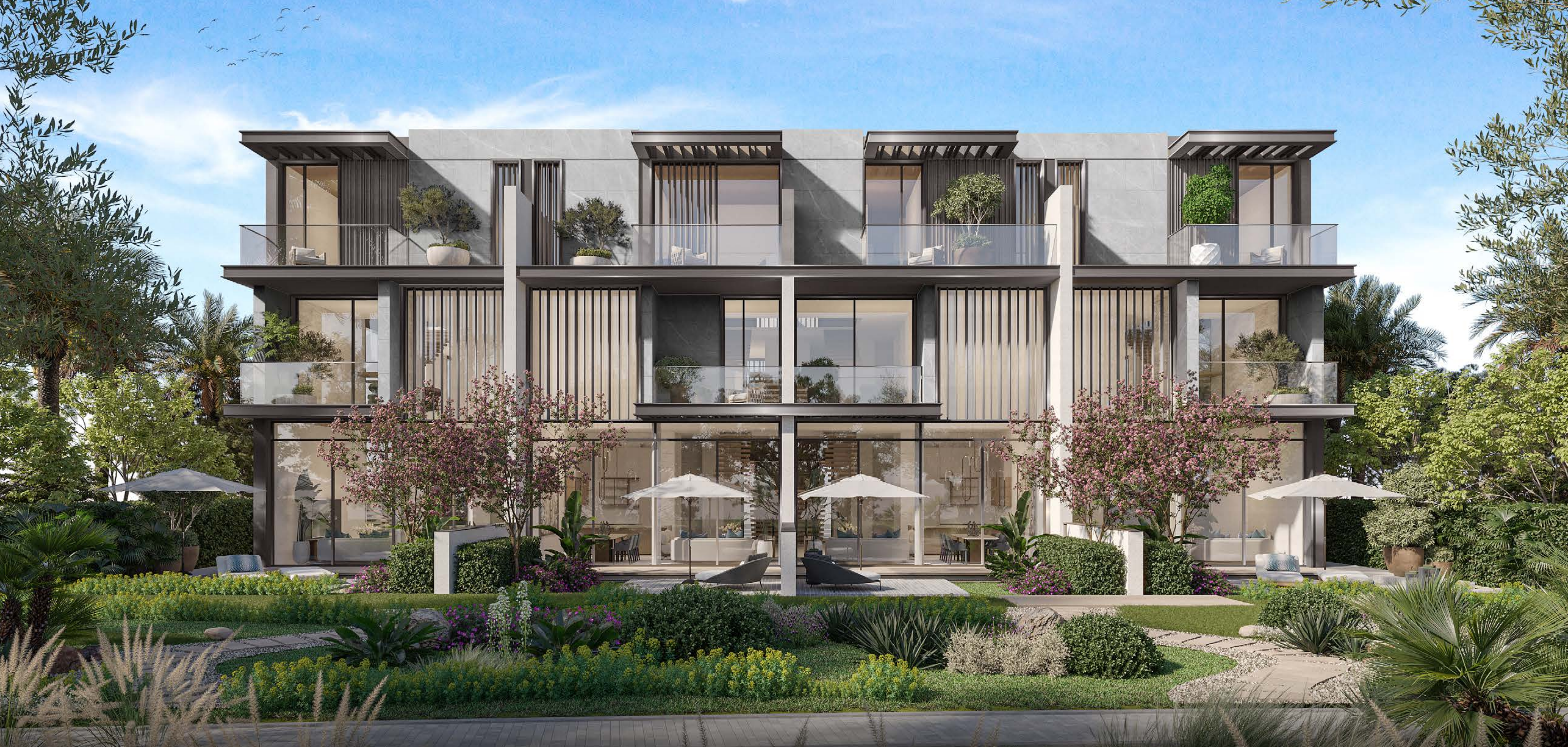
3-BEDROOM TOWNHOUSE | G+2 | 4PLEX