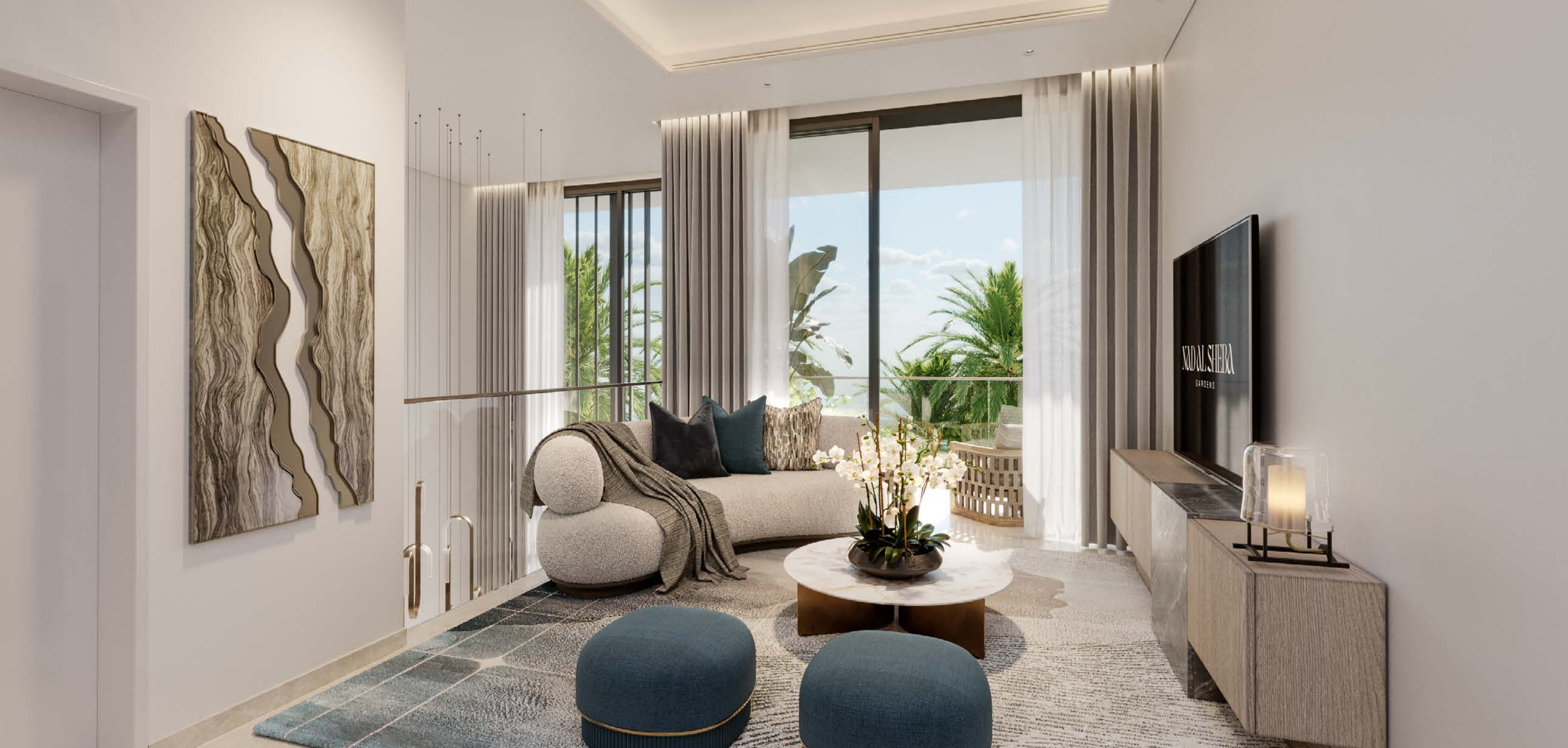
3-BEDROOM TOWNHOUSE | FAMILY ROOM