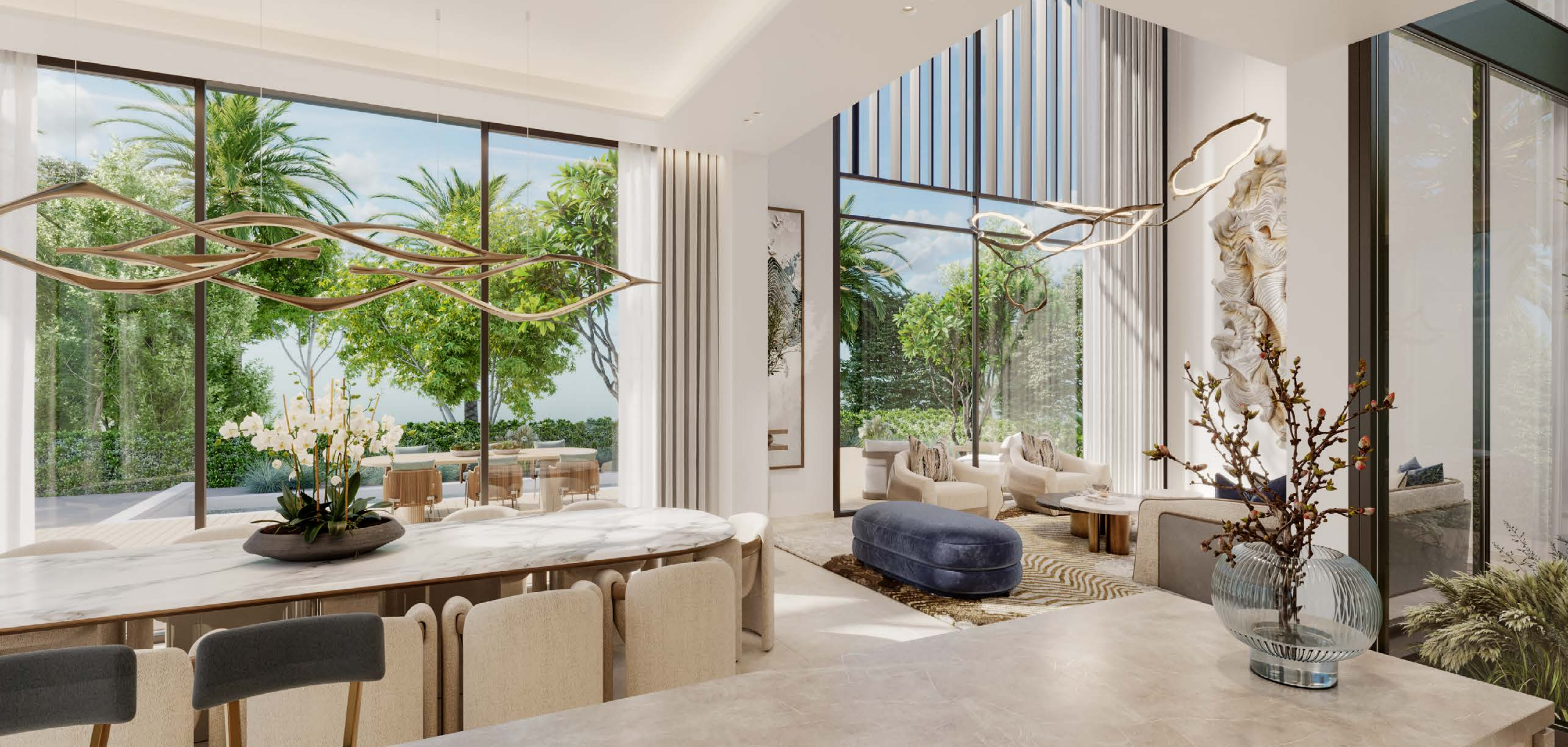
4-BEDROOM VILLA | LIVING & DINING