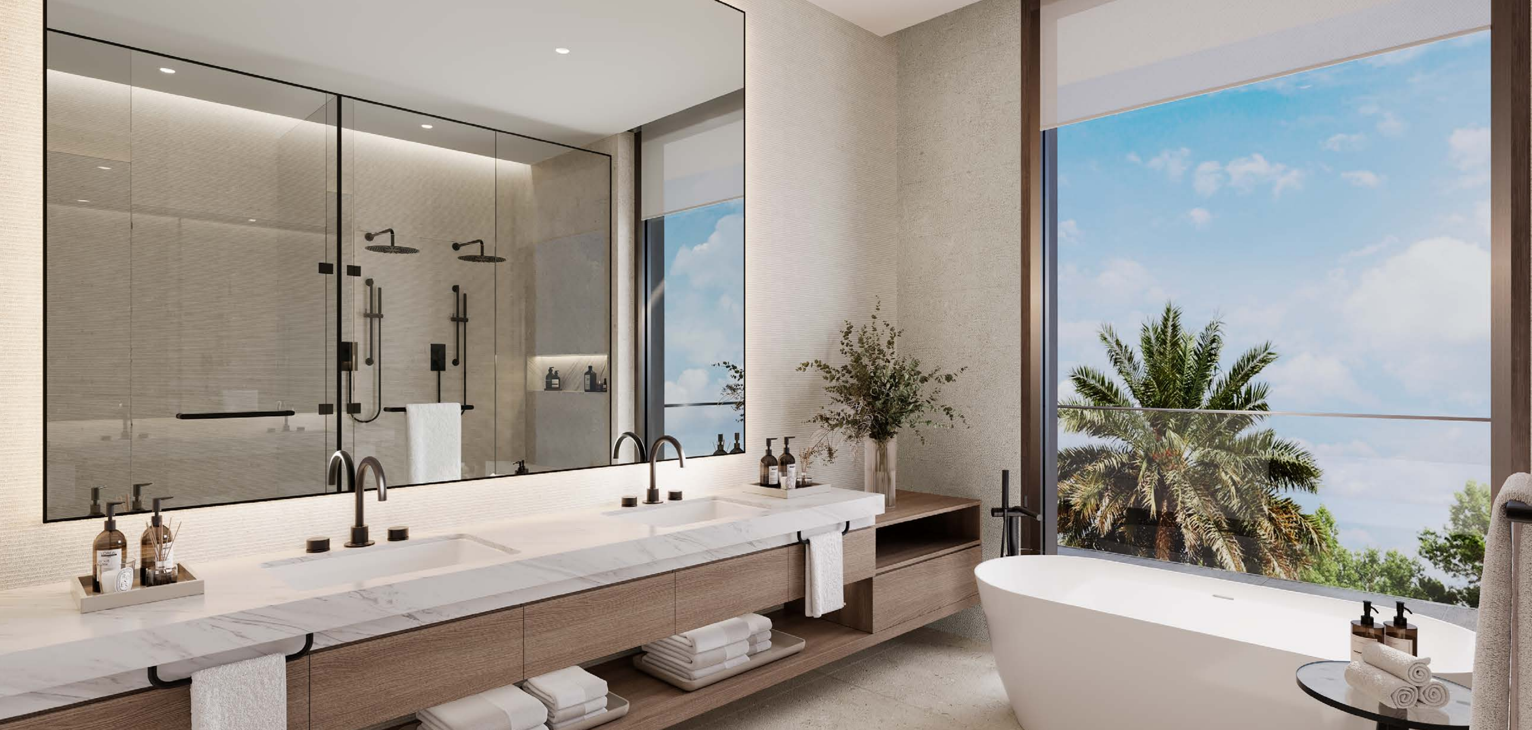
7-BEDROOM VILLA | MASTER BATHROOM