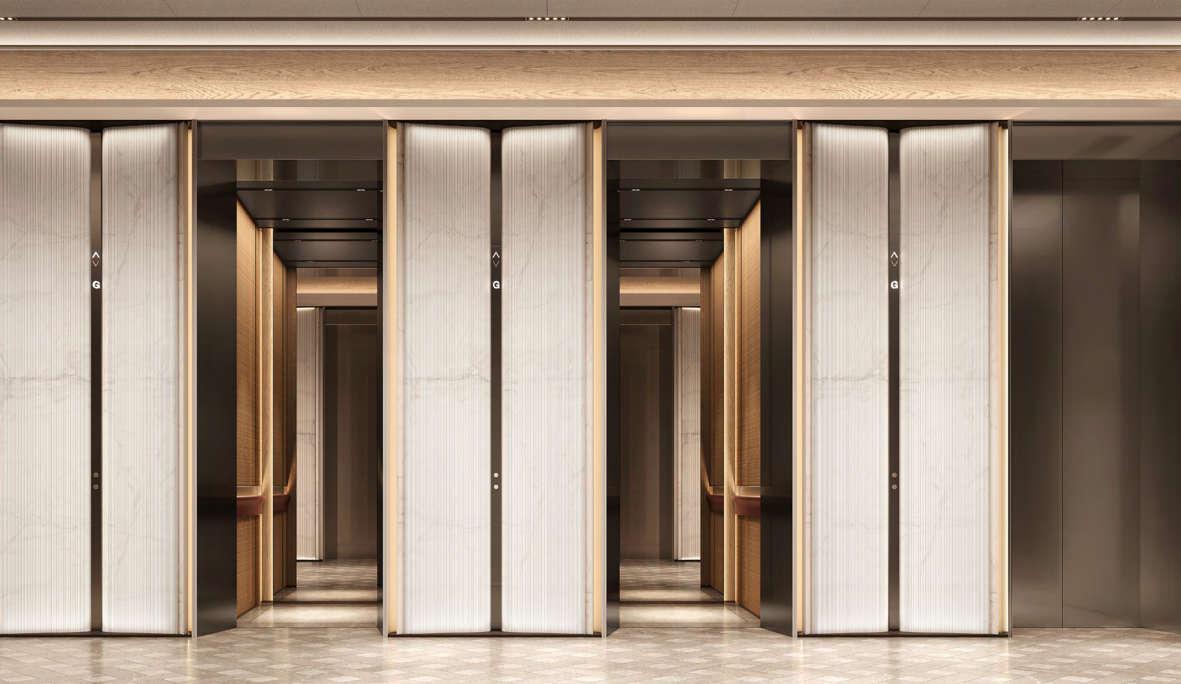
GROUND FLOOR LIFT LOBBY