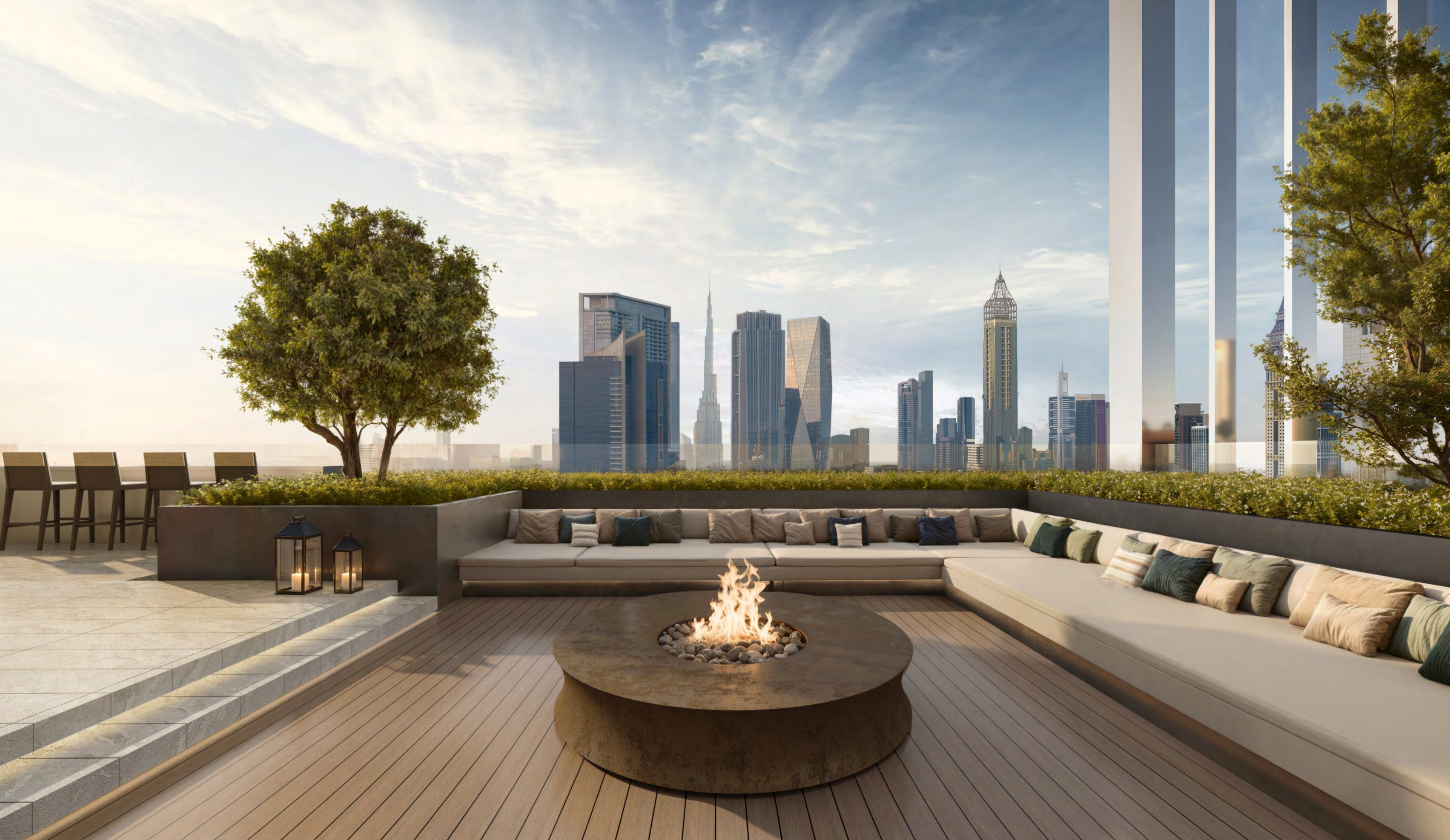
SKY TERRACE LOUNGE AREA