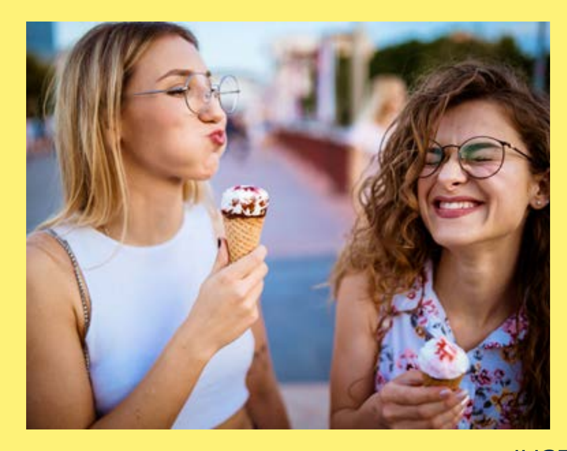
JUST AROUND THE CORNER